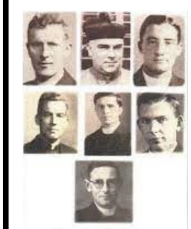
They Died In Korea