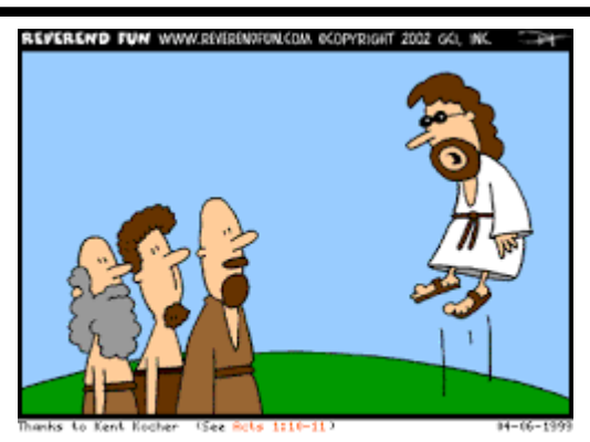
I'LL BE BACK