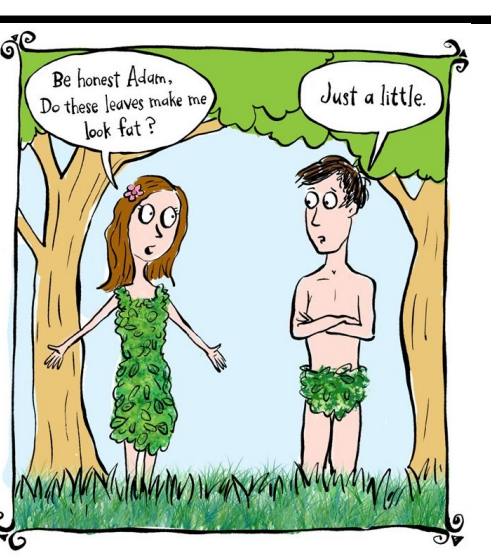
Man's second BIG mistake.