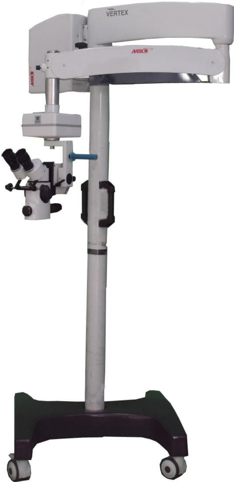
Standard set VERTEX-OpH5 floor model X-y coupling, varioscope & foot Control