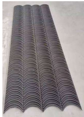
Classical tiles 2400x400mm