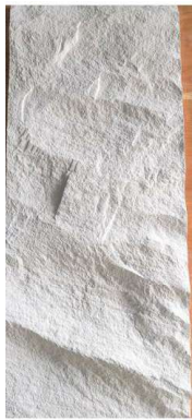
Large stone plate 1200x1800(2)mm