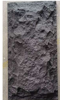
Mushroom Stone -- 900x450 (1)mm