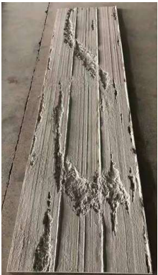
Cement 2400 x600mm