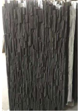
Miscellaneous stone 1200 x600mm