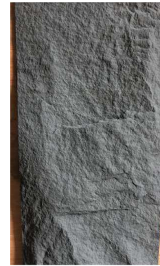
Concave and convex strong surface of stone 1200*600mm