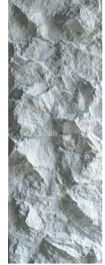
Rock wall jagged and jagged large plate 2400x800mm