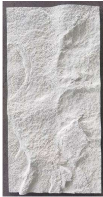
Light clay Shi Pi 1200*600mm