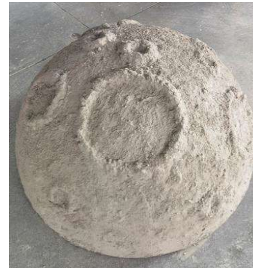
Ball - 1200 in diameter