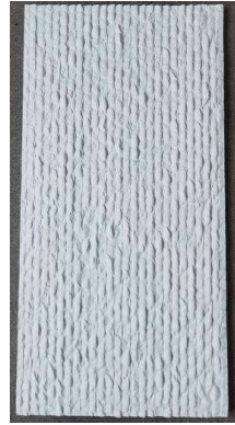
Star marble 1200 x600mm