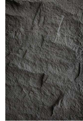
Large stone plate 1200x1800mm