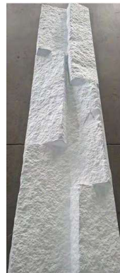
New stone column 2400x500mm