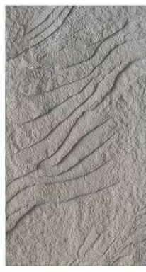
Black Mountain rock connected plate -- 1500X750 (2)mm