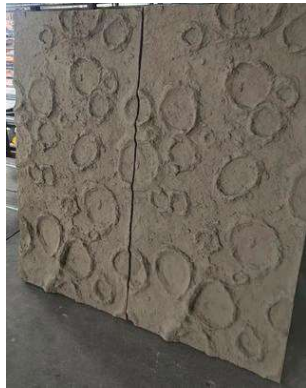
Moonstone 1200x600 (1)mm