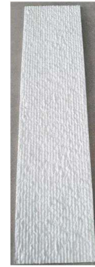
Star marble 2400 x600mm