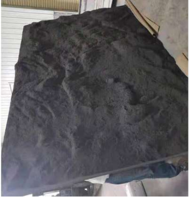
Manual rock 3600x3100mm