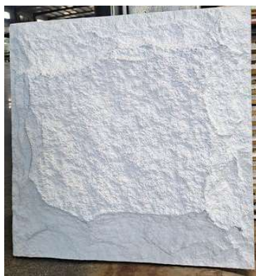
Mushroom stone 600 x600mm