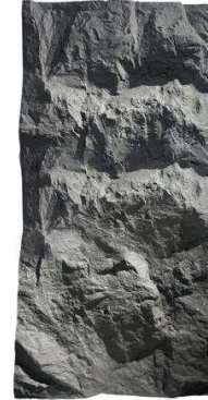
Steep rock 1200×600mm