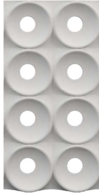
Chord components 600X1200mm