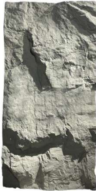
Steep rock 1200×600mm