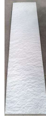
Sheet 2400 x 600mm