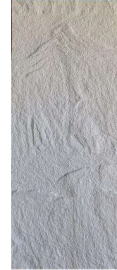
Rock wall jagged and jagged large plate 1200x3000mm