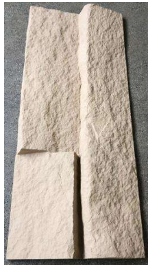
New stone column 1200x500mm