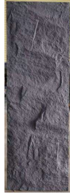
Stone middle plate 2400x800 (1)mm