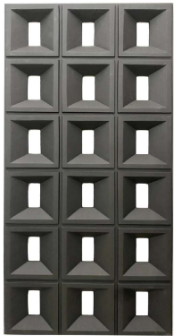
Trapezoidal member 1200X600mm