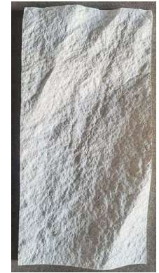
Concave and convex strong surface of stone 1200*600mm