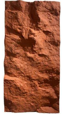
Steep rock 1200×600mm