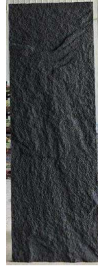
Stone leather middle plate 2400x800(2) mm