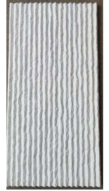
New Running stone 1200x600mm