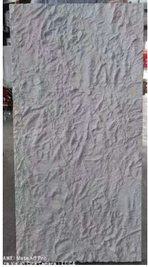
Black Mountain rock small rubble 600×2400(2)mm