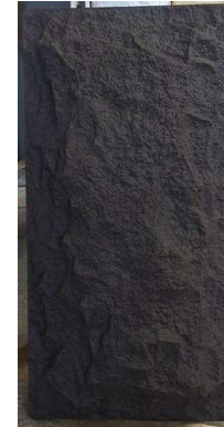
Mushroom Stone 1200x600 (2)mm