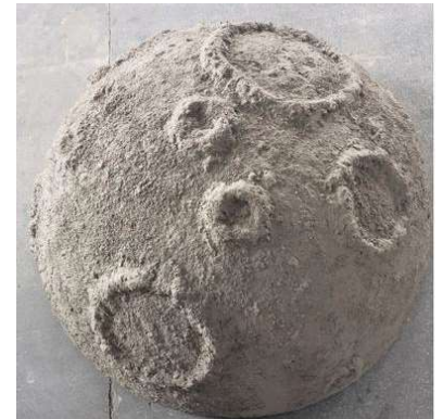
Ball - half 1200 in diameter