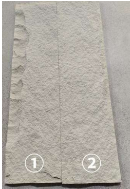
Light clay Shi Pi 1200*300mm