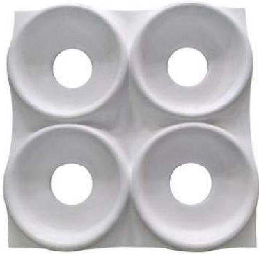
Chord components 600X600mm