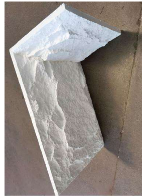
Mushroom stone Yin Angle 1200x200-400mm