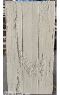
Cement 1200 x600mm