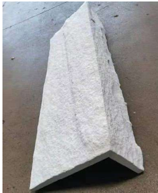
Shipi Yang Angle 1200x200-400mm