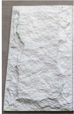
Mushroom Stone 1000x600 (2)mm