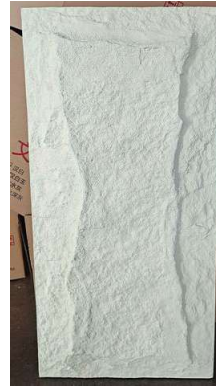
Mushroom Stone 1200x600 (1)mm