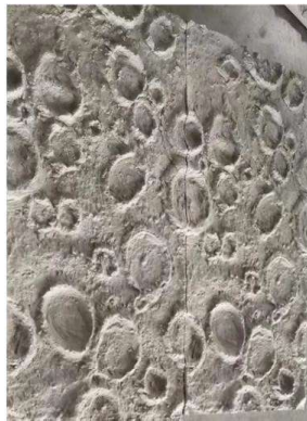
Moonstone 1200x600 (2)mm