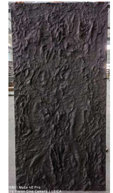
Black Mountain rock small rubble 600x2400(1)mm