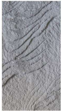
Black Mountain rock connected plate 1500X750 (1)mm