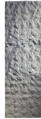
Briquette medium plate 1800x600mm