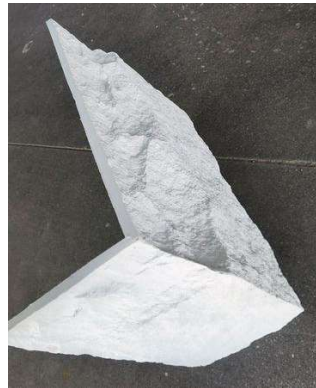
Mushroom Shiyang Angle 1200x200-400mm