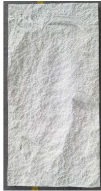
Light clay Shi Pi 1200*600mm