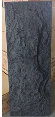
Mushroom stone 1200 x450mm