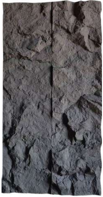
Steep rock 2400×600mm