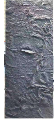
Large stone plate 1200x1800(1)mm