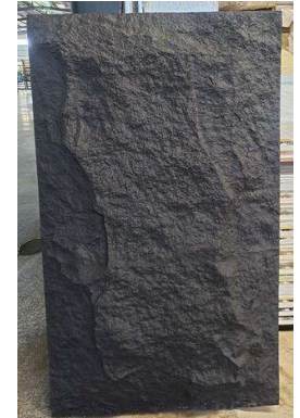
Mushroom Stone 1000x600 (1)mm