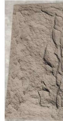
Mushroom Stone -- 900x450 (2)mm