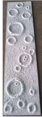
moon stone 3000 x750mm