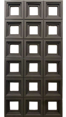
Return member 1200X600mm