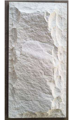
Mushroom Stone 1500x750 (1)mm