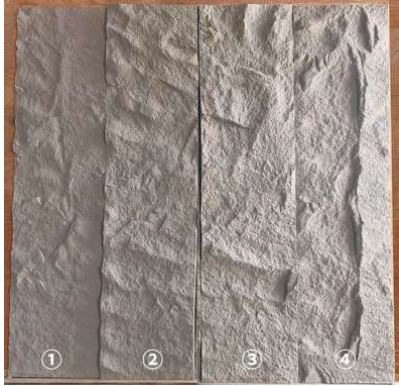
Stone middle plate 2400x600mm