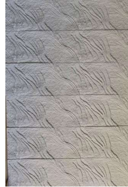
Montenegrin interleaved middle plate 3000x750mm