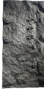
Steep rock 1200×600mm