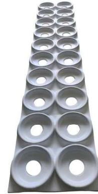
Chord components 600X3000mm