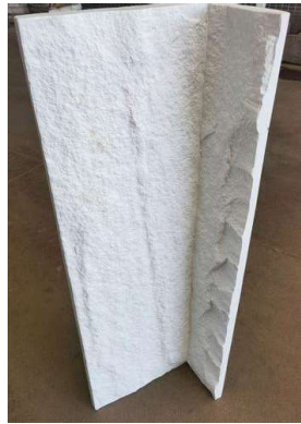
Shipi Yin Angle 1200x200-400mm