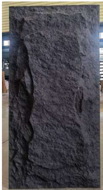
Mushroom Stone 1500x750 (2)mm