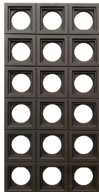
Circular member 1200X600mm