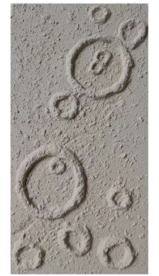
Moonstone 1500X750 (2)mm