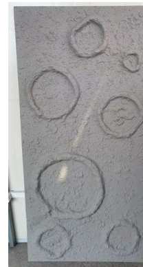
Moonstone 1500X750 (1)mm