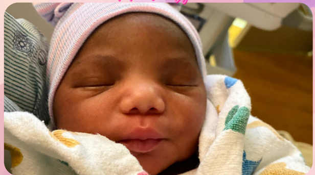
Baby Majesty born on April 25th @ 2:28 am 6lbs 4 oz