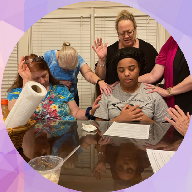
Women of Aglow praying for a resident of the Haven

please Contact us at 832.437.8529 or 832.217.4892 .