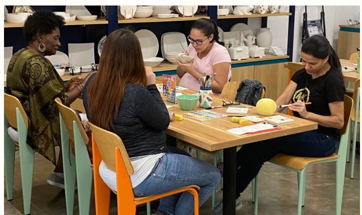
Keturah's Haven staff and residents enjoying pottery painiting .