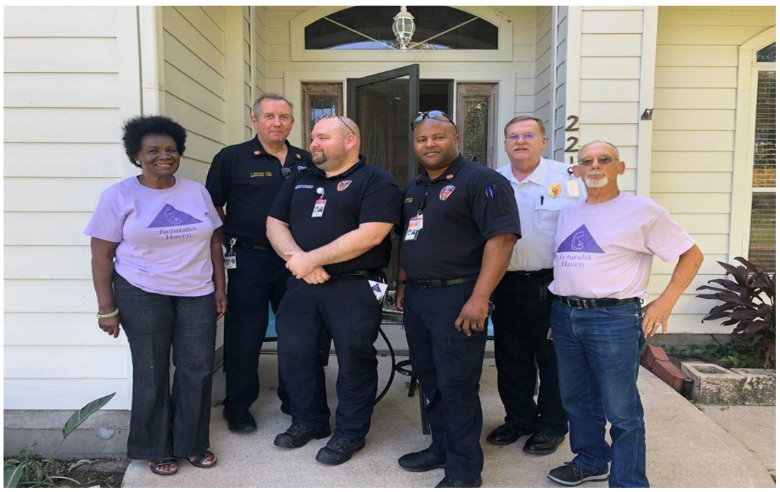
Katy Fire Department #48 Supporters