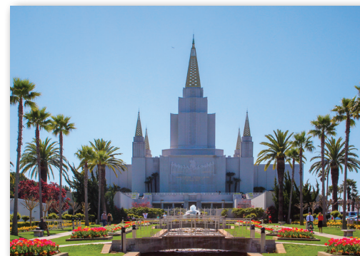
TEMPLE HILL IN BLOOM

Sometime we'll fall on bended knee and feel there, graven on His hand; sometime with tearless eyes we'll see what here, we could not understand.