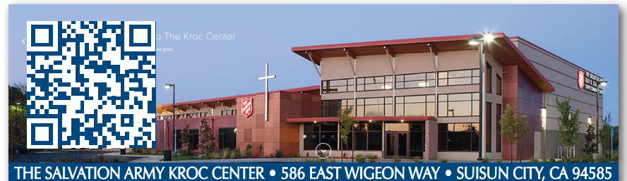
THE SALVATION ARMY KROC CENTER • 586 EAST WIGEON WAY • SUISUN CITY, CA 94585