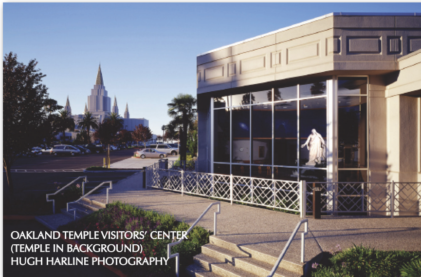
OAKLAND TEMPLE VISITORS' CENTER (TEMPLE IN BACKGROUND)

The general public is invited to attend tours of the temple grounds and the Visitors' Center.