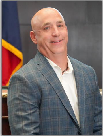
Mayor Frank Ritchie