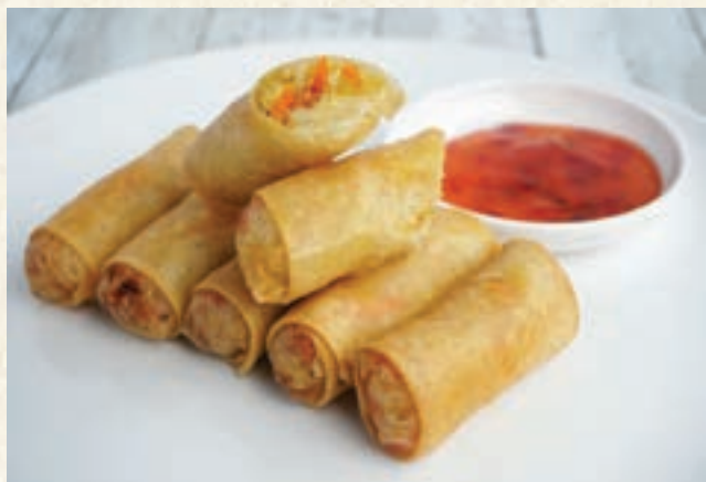
Thai Mini Spring Rolls