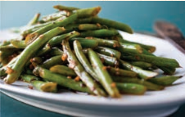
Mala Green Beans