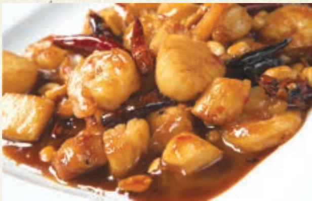
Kung Pao Scallops & Shrimp