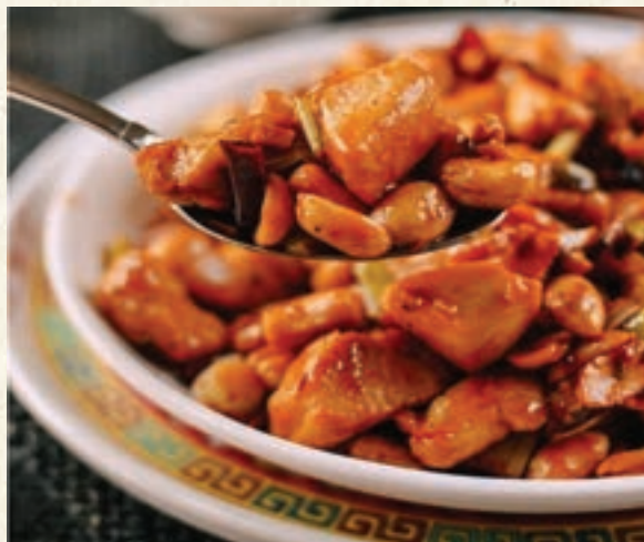
Kung Pao Chicken

Battered and deep-fried chicken breast • 16.95