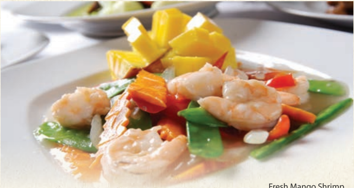
Fresh Mango Shrimp