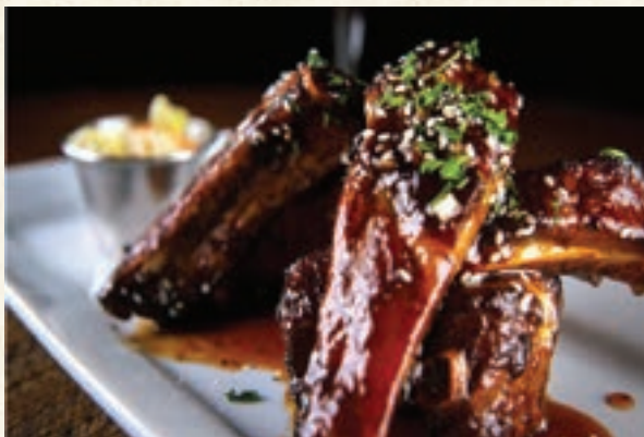
Hunan Spare Ribs

🌶️ These dishes are spicy and can be prepared hotter or milder upon request. Please let your server know before ordering if you have any allergies.