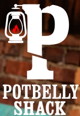
TABLE FOR 40 TOSCANO