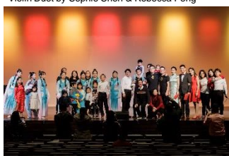
Event was successfully closed with a group photo