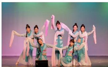
Dance by C - Motion Dance Group