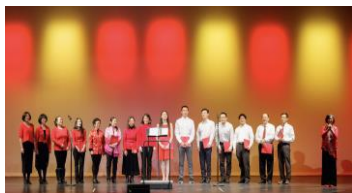
Songs by Corning Chinese Christian Church