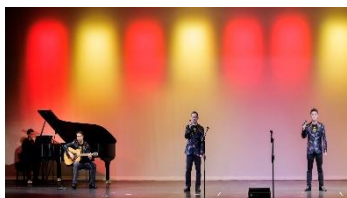
Songs by Alta Band