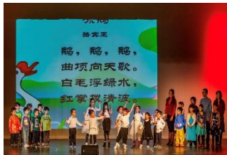
Poem Singing by Kids from Corning Chinese School