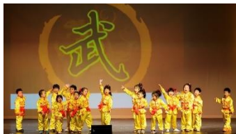
Kungfu Dance by kids from Corning Chinese School