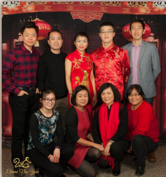
CCA Committee Members