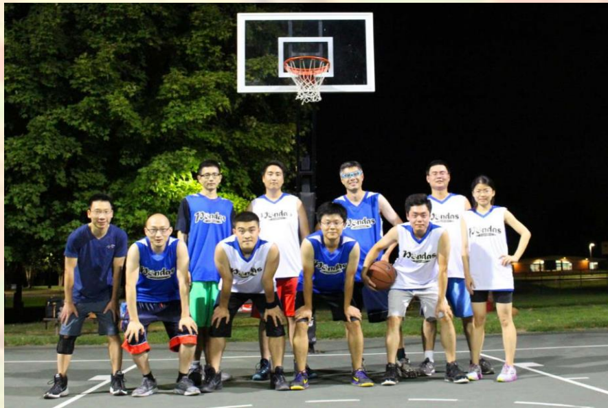
MTE vs. S&T Game: