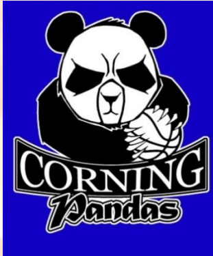
CCA Basketball Team Logo