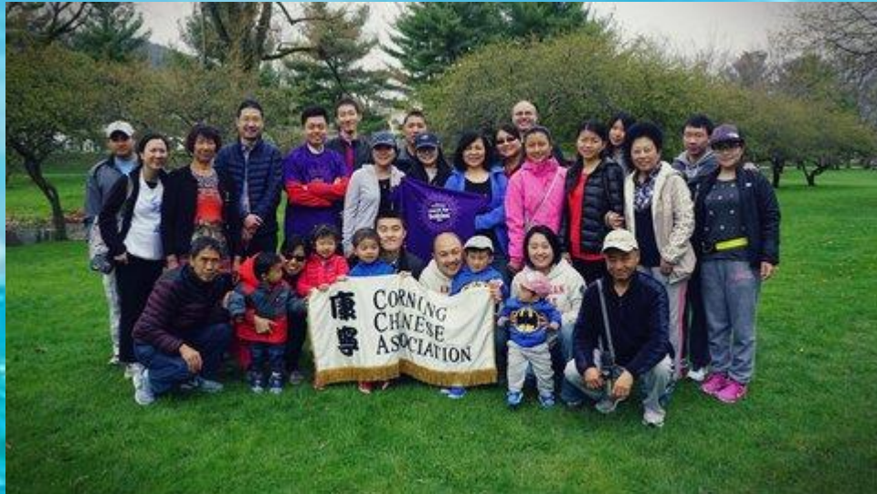
CCA members in the event of 2016 March for Babies

CCA joined the Southern Tier March for Babies again this year. March for Babies is a charitable three mile walking event organized by the March of Dimes. About 1,100 communities across the USA join this annual event each year. The purpose of the event is to raise funds to help defeat prematurity, birth defects and infant mortality.