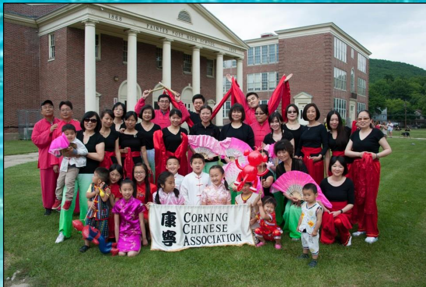
Group photo CCA members who participated this parade, including Yangge dance team, kids fashion show team, drum & gong team, logistics support team.

Colonial Day has been a traditional local event for Corning area. The first Colonial Days was proclaimed in June, 1964 with a celebration “in official recognition of the improvements made in the business district of the Village”. After so many years it's been one of the largest and longest consecutively held outdoor festivals in the upstate New York, including the largest professionally judged High School Marching Band parade in the New York State.