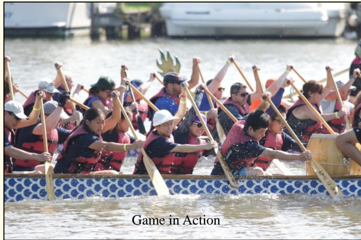
Game in Action

Despite the ten-year history of this annual event, this is the first year a team representing Corning's ethnic group participated in the race. With Corning's spirit of endeavor and strong teamwork, Corning warriors really stood out during all the four races they participated and were awarded the bronze medal in the community team competition. To achieve this goal, Corning Chinese Association and MTE Asian & Latin Group put together a team that consists of 25 Corning employees and their family.