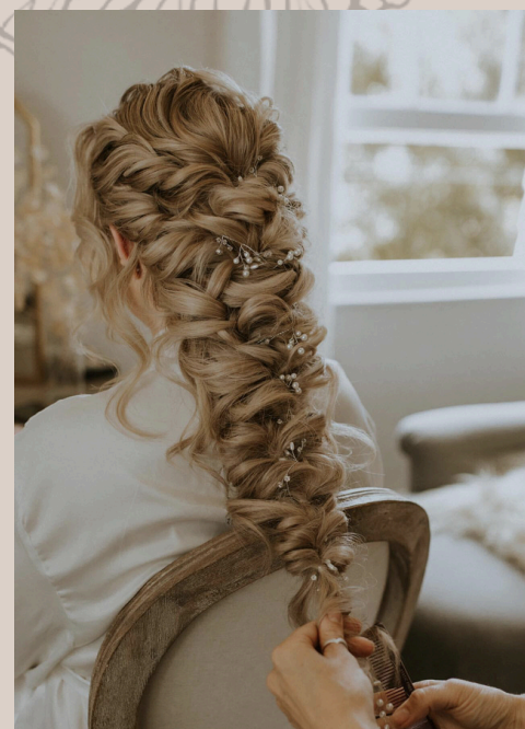
"ELYSE" HAIRVINE WWW.THEBOBBYPIN.CO.UK