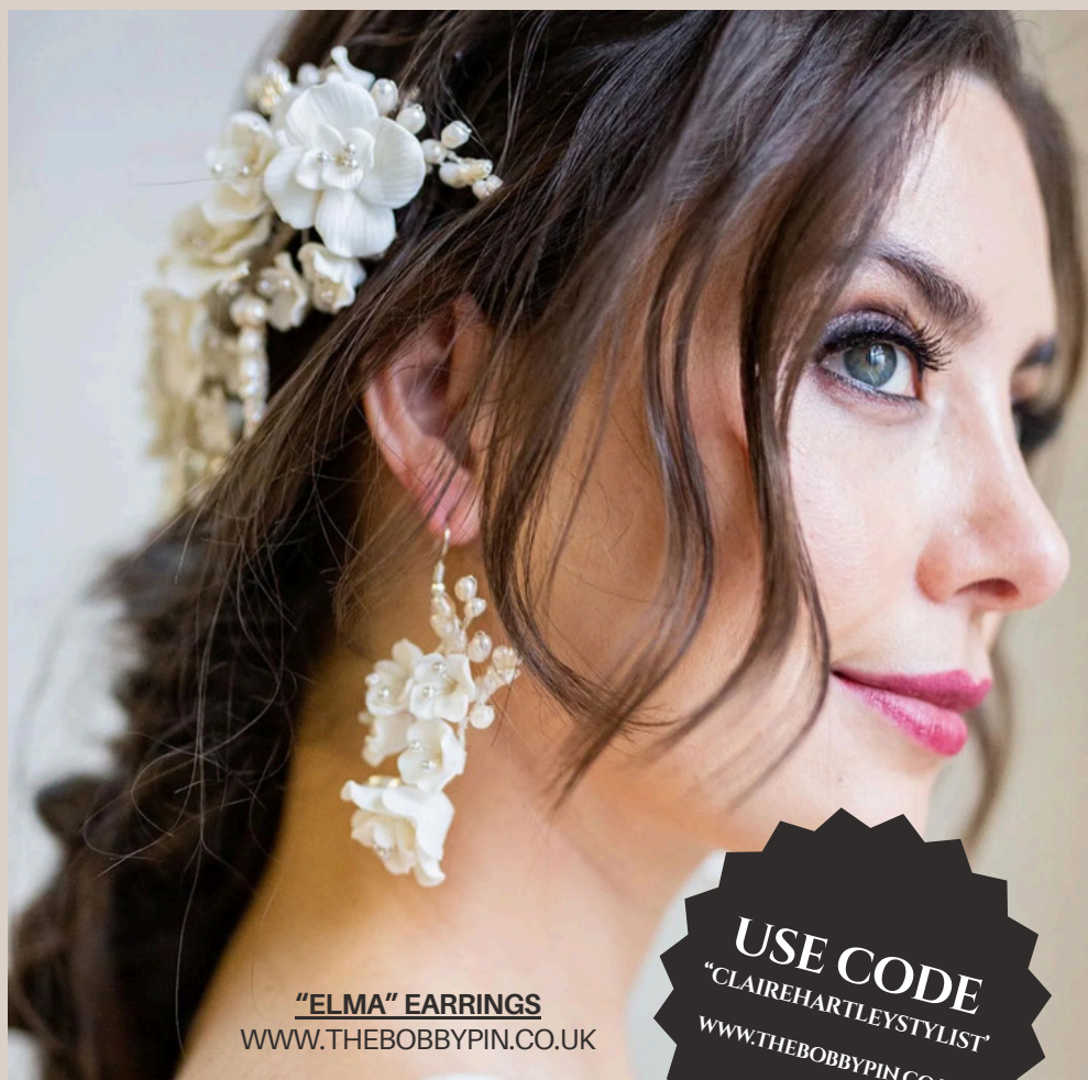
"ELMA" EARRINGS WWW.THEBOBBYPIN.CO.UK