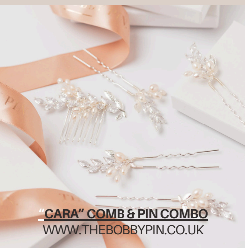
"CARA" COMB & PIN COMBO WWW.THEBOBBYPIN.CO.UK