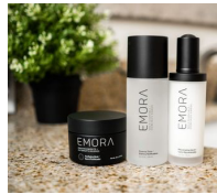
Emora Skin Care

Linq- Gut & Brain Health Optimend- Pain & Inflammation dramatically reduced GNMX- Activates Nrf2 fighting free radical damage and turning back the clock