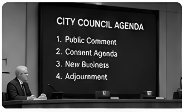
City Council Agenda