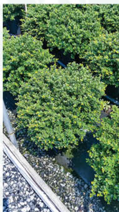
ILEX CRENATA HELLERI' HELLERI DWARF JAPANESE HOLLY

Height: 2 - 3', Foliage: Glossy green, Spread: 4 - 6', Fall Foliage: N/A, Zone: 5 - 8, Shape: Spreading