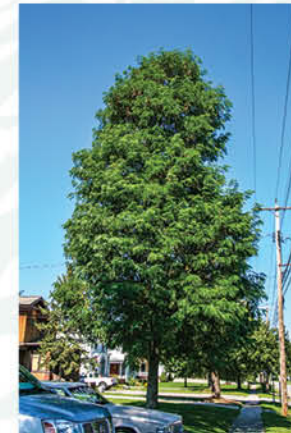
GLEDITSIA TRIACANTHOS INERMIS STREET KEEPER LOCUST

Height: 45', Foliage: Green, Spread: 30', Fall Foliage: Yellow, Zone: 4 - 9, Shape: Ascending, pyramidal