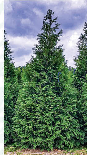
THUJA PLICATA 'GREEN GIANT' GREEN GIANT ARBORVITAE

Height: 20 - 30', Foliage: Green, Spread: 5 - 10', Fall Foliage: Bronze-green, Zone: 2 - 8, Shape: Upright