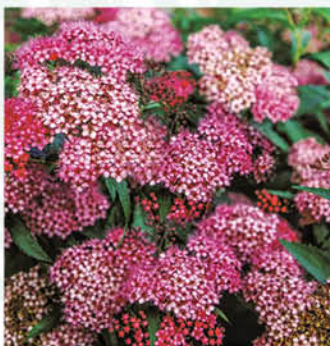
SPIRAEA JAPONICA 'NEON FLASH' NEON FLASH SPIREA

Height: 2 - 3', Foliage: Green, Spread: 2 - 3', Fall Foliage: Yellow- brown, Zone: 4 - 8, Shape: Round