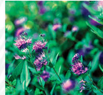
CARYOPTERIS X CLANDONENSIS BLUE MIST SPIREA

Height: 3 - 5', Foliage: Green, Spread: 3 - 5', Fall Foliage: Green-bronze, Zone: 6 - 9, Shape: Round