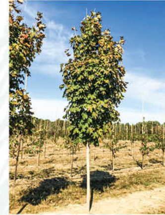
ACER SACCHARUM 'ENDOWMENT' ENDOWMENT SUGAR MAPLE

Height: 40 - 50', Foliage: Textured green, Spread: 30 - 40', Fall Foliage: Fire red, Zone: 5 - 8, Shape: Dense, upright