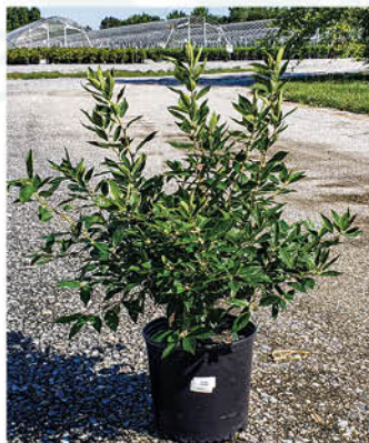
ILEX VERTICILLATA 'WINTER RED' WINTER RED WINTERBERRY

Height: 5 - 8', Foliage: Dark green, Spread: 5 - 8', Fall Foliage: Yellow, Zone: 3 - 9, Shape: Upright, round