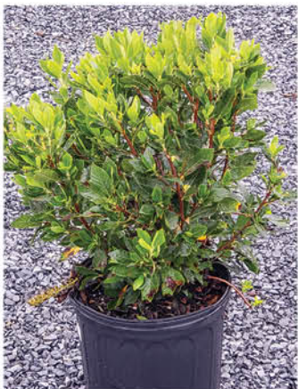
CLETHRA ALNIFOLIA 'SIXTEEN CANDLES' SIXTEEN CANDLES CLETHRA

A vigorous cultivar boasting large 4-6" persistent fragrant white flowers.