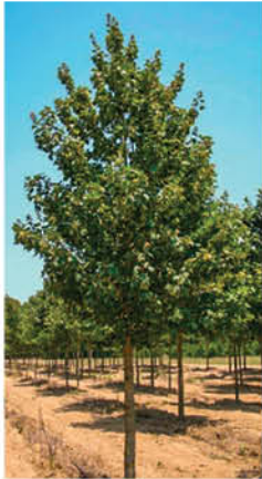
ACER CAMPESTRE 'QUEEN ELIZABETH' QUEEN ELIZABETH MAPLE

Environmentally adaptable, withstands strong pruning. Rounded head with a flat top in maturity. Good street tree.