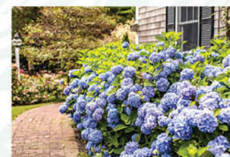
HYDRANGEA MACROPHYLLA 'ALL SUMMER BEAUTY' ALL SUMMER BEAUTY HYDRANGEA

Height: 4', Foliage: Smooth with silvery undersides, Spread: 8', Fall Foliage: Yellow, Zone: 4 - 8, Shape: Spreading