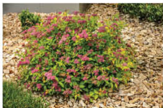
SPIRAEA JAPONICA 'WALBUMA' MAGIC CARPET SPIREA

A compact grower with brilliant red foliage with beautiful pink flowers.