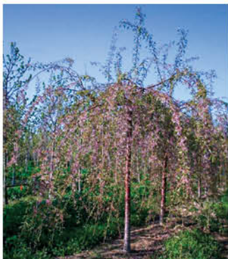
PRUNUS PISNSHZAM 'PINK SNOW SHOWERS' PINK SNOW SHOWERS WEeping CHERRY

Graceful weeping branches covered in pink flowers in Spring.