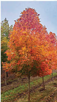
ACER SACCHARUM 'FALL FIESTA' FALL FIESTA SUGAR MAPLE

Height: 40 - 50', Foliage: Green, Spread: 6 - 10', Fall Foliage: Red- yellow, Zone: 3 - 8, Shape: Upper, fastigate