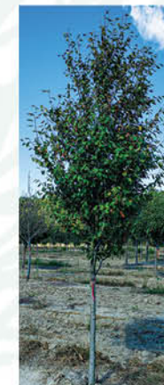
AMELANCHIER HYBRID 'CUMULUS' CUMULUS SERVICEBERRY TREE FORM

Height: 50 - 60', Foliage: Rich, glossy green, Spread: 30 - 40', Fall Foliage: Yellow-red, Zone: 4 - 8, Shape: Oval, ascending