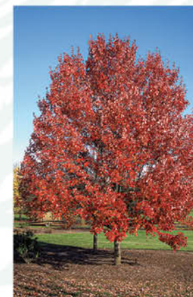
ACER RUBRUM 'OCTOBER GLORY' OCTOBER GLORY MAPLE

Height: 40 - 50', Foliage: Green, Spread: 25 - 30', Fall Foliage: Red, Zone: 4 - 8, Shape: Pyramidal