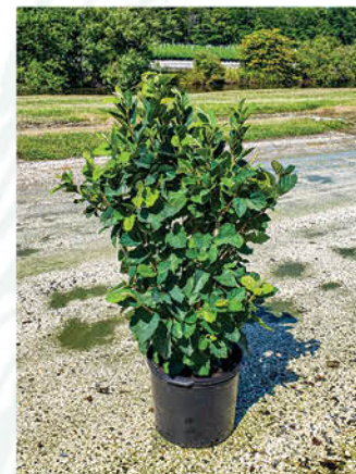
HAMAMELIS VERNALIS VERNAL WITCHHAZEL

Height: 5 - 6', Foliage: Textured rich blue-green, Spread: 5 - 6', Fall Foliage: Yellow-orange, Zone: 5 - 8, Shape: Upright