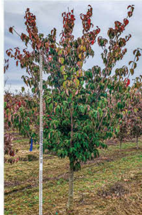
CORNUS 'RUTGAN' STELLAR PINK DOGWOOD

Height: 20', Foliage: Green, Spread: 10 - 15', Fall Foliage: Purple, Zone: 4 - 7, Shape: Upright