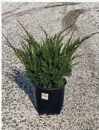
JUNIPERUS CHINENSIS 'SEA GREEN' SEA GREEN JUNIPER

Height: 2 - 4', Foliage: Rich green, Spread: 5 - 8', Fall Foliage: Green, Zone: 4 - 9, Shape: Spreading