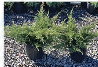
JUNIPERUS CHINENSIS 'PFTIZERIANA COMPACTA' COMPACT PFTIZER JUNIPER

Height: 3 - 4', Foliage: Green w/ Yellow, Spread: 3 - 5', Fall Foliage: N/A, Zone: 4 - 9, Shape: Spreading