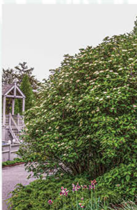
VIBURNUM LANTANA 'MOHICAN' MOHICAN WAYFARINGTREE VIBURNUM

Height: 6 - 8', Foliage: Green, Spread: 4 - 6', Fall Foliage: N/A, Zone: 5 - 8, Shape: Round