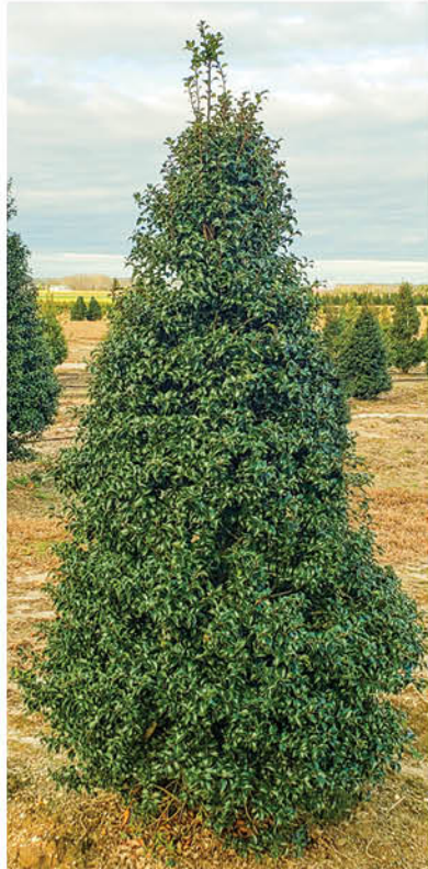
ILEX AQUIPERNYI 'DRAGON LADY' DRAGON LADY HOLLY

A strong pyramidal growth habit makes this plant very versatile.