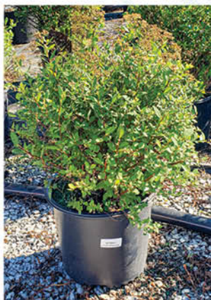
SPIRAEA JAPONICA 'LITTLE PRINCESS' LITTLE PRINCESS SPIREA

Height: 2 - 3', Foliage: Gold-green, Spread: 2 - 3', Fall Foliage: Bronze, Zone: 3 - 8, Shape: Round