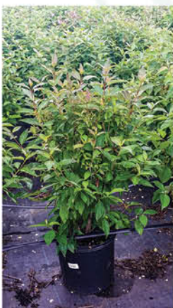
CORNUS RACEMOSA GRAY DOGWOOD

Height: 6 - 10', Foliage: Green, Spread: 6 - 10', Fall Foliage: Purple, Zone: 4 - 8, Shape: Round