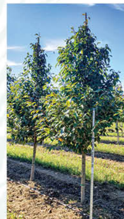
PRUNUS SERRULATA 'KWANZAN' KWANZAN CHERRY

Height: 50 - 80', Foliage: Green, Spread: 15 - 20', Fall Foliage: Yellow to red, Zone: 4 - 8, Shape: Upright, round