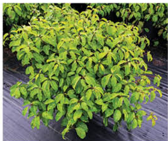
CORNUS SERICEA 'KELSEY'S DWARF' KELSEY'S DWARF RED TWIG DOGWOOD

Bright red stems in the Winter and abundant white flowers in the Spring.