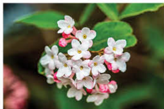
VIBURNUM X JUDDII JUDDI VIBURNUM

The 2-3" fragrant white flowers on this large round Viburnum make it ideal for mass plantings.