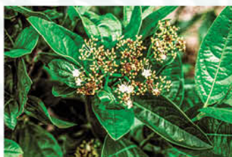
VIBURNUM NUDUM 'WINTERTHUR' WINTERTHUR VIBURNUM

Height: 15 - 20', Foliage: Green, Spread: 15 - 20', Fall Foliage: Yellow Zone: 3 - 7, Shape: Upright