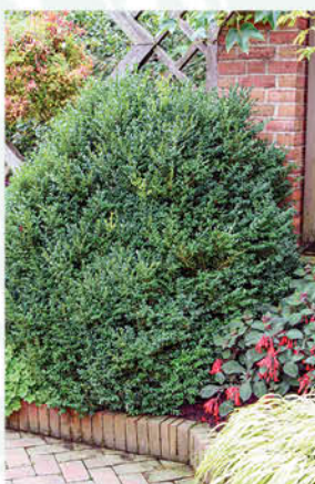
BUXUS X 'GREEN MOUNTAIN' GREEN MOUNTAIN BOXWOOD

Height: 10 - 15', Foliage: Green, Spread: 2 - 10', Fall Foliage: Green, Zone: 5 - 9, Shape: Spreading