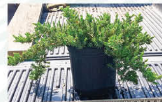
JUNIPERUS CONFERTA 'BLUE PACIFIC' BLUE PACIFIC JUNIPER

Height: 4 - 6', Foliage: Green, Spread: 4 - 6', Fall Foliage: Green, Zone: 4 - 8, Shape: Spreading