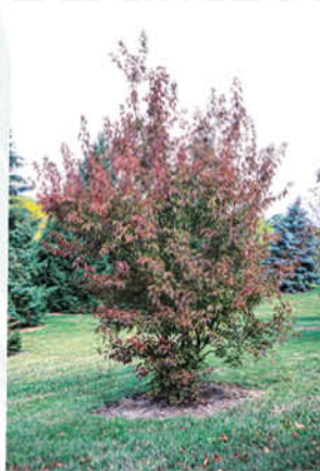
ACER GINNALA 'FLAME' FLAME AMUR MAPLE TREE FORM

Height: 30 - 35', Foliage: Rich green, Spread: 30 - 35', Fall Foliage: Yellow, Zone: 4 - 8, Shape: Oval, round