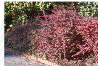
BERBERIS THUNBERGII ATROPURPUREA 'ROSE GLOW' ROSY GLOW BARBERRY

Height: 3 - 6', Foliage: Burgundy, Spread: 4 - 7', Fall Foliage: Purple-red, Zone: 4 - 7, Shape: Upright