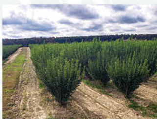
LIGUSTRUM OVALIFILIUM 'CALIFORNIA PRIVET' CALIFORNIA PRIVET

Height: 15 - 18", Foliage: Lime-green, Spread: 8 - 10', Fall Foliage: Purple, Zone: 3 - 9, Shape: Spreading