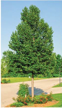
TILIA AMERICANA 'AMERICAN SENTRY' AMERICAN SENTRY LINDEN

A more symmetrical cultivar with slightly smaller spread.