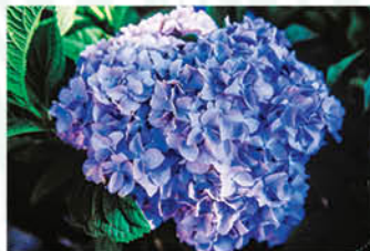
HYDRANGEA MACROPHYLLA 'NIKKO BLUE' NIKKO BLUE HYDRANGEA

Height: 3 - 5', Foliage: Green, Spread: 3 - 5', Fall Foliage: Bronze, Zone: 4 - 9, Shape: Round