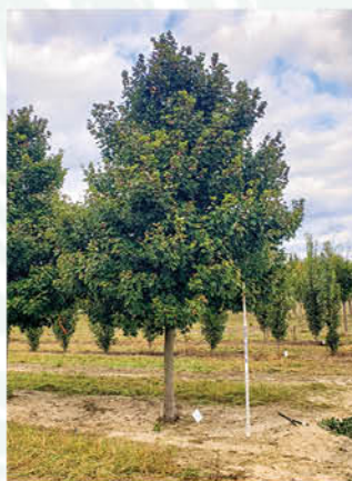
ACER RUBRUM 'FRANK JR.' REDPOINTE RED MAPLE

Height: 40 - 50', Foliage: Green with a silver underside, Spread: 40', Fall Foliage: Orange-red, Zone: 4 - 8, Shape: Oval, round