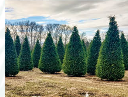
CUPRESSOCYPARIS LEYLANDII LEYLAND CYPRESS

Height: 50 - 60', Foliage: Blue-green, Spread: 20 - 30', Fall Foliage: Green-bronze, Zone: 5 - 6, Shape: Pyramidal