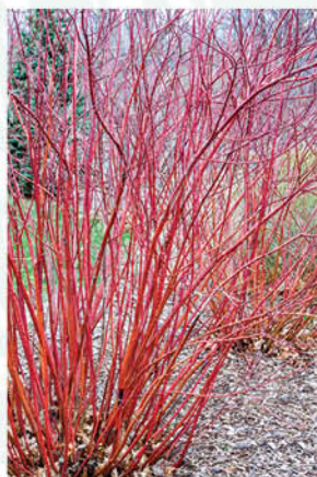
CORNUS SERICEA BAILEYI BAILEY RED TWIG DOGWOOD

Height: 10 - 15', Foliage: Green, Spread: 10 - 15', Fall Foliage: Purple, Zone: 4 - 8, Shape: Upright, round