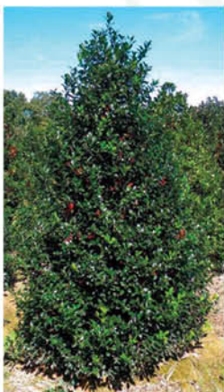
ILEX X MESERVEAE 'BLUE PRINCESS' BLUE PRINCESS HOLLY

Height: 10 - 12', Foliage: Blue-green, Spread: 6 - 8', Fall Foliage: Green, Zone: 5 - 9, Shape: Round