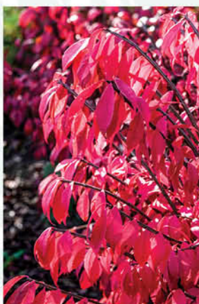
EUONYMUS ALATUS COMPACTUS DWARF BURNING BUSH

Height: 1 - 2', Foliage: Green, Spread: 2 - 5', Fall Foliage: Yellow, Zone: 5 - 8, Shape: Round