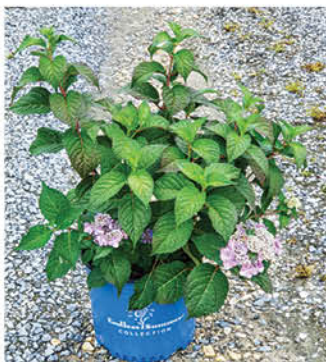
HYDRANGEA MACROPHYLLA 'ENDLESS SUMMER' ENDLESS SUMMER HYDRANGEA

Blooming off new and old wood, this Hydrangea will give you large blooms all season long.