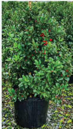
ILEX X MESERVEAE 'BLUE MAID' BLUE MAID HOLLY

Height: 3 - 5', Foliage: Glossy green, Spread: 3 - 5', Fall Foliage: Green, Zone: 5 - 8, Shape: Compact, round