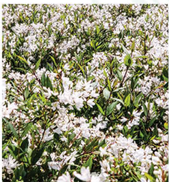
DEUTZIA GRACILIS 'NIKKO' NIKKO DEUTZIA

Height: 4 - 5', Foliage: Dark green, Spread: 6 - 8', Fall Foliage: Red-purple, Zone: 6 - 8, Shape: Spreading, pendulous