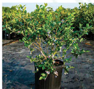
VACCINIUM X DUKE DUKE BLUEBERRY

Height: 5 - 6', Foliage: Green, Spread: 4 - 6', Fall Foliage: Red, Zone: 4 - 7, Shape: Upright