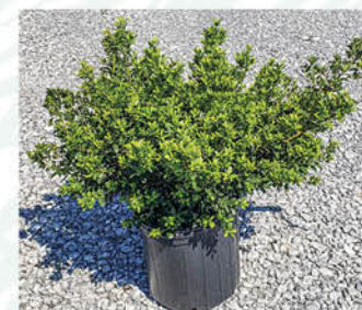
ILEX CRENATA 'HOOGENDORN' HOOGENDORN JAPANESE HOLLY

Height: 3', Foliage: Dull green, Spread: 4', Fall Foliage: N/A, Zone: 5 - 8, Shape: Mound