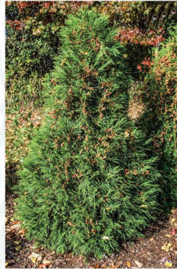
THUJA OCCIDENTALIS 'NIGRA' DARK AMERICAN ARBORVITAE

Height: 10 - 15', Foliage: Rich green, Spread: 3 - 4', Fall Foliage: N/A, Zone: 2 - 8, Shape: Upright