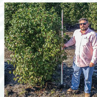
VIBURNUM DENTATUM ARROWWOOD VIBURNUM

Height: 4 - 8', Foliage: Green, Spread: 4 - 8', Fall Foliage: Red, Zone: 4 - 7, Shape: Round