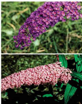
BUDDLEIA DAVIDII BUTTERFLY BUSH

Height: 3 - 4', Foliage: Rosy red, Spread: 2 - 3', Fall Foliage: Maroon, Zone: 4 - 7, Shape: Round, open