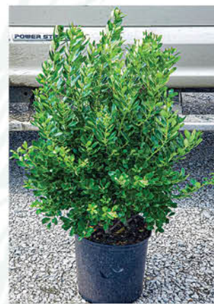
ILEX GLABRA COMPACTA COMPACT INKBERRY

Height: 6 - 8', Foliage: Glossy green, Spread: 4 - 6', Fall Foliage: N/A, Zone: 5 - 8, Shape: Pyramidal