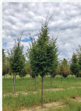
ZELKOVA SERRATA 'GREEN VASE' GREEN VASE ZELKOVA

Height: 30 - 40', Foliage: Green, Spread: 20 - 30', Fall Foliage: Yellow Zone: 4 - 9, Shape: Vase