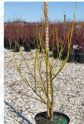
CORNUS SERICEA 'BUD'S YELLOW' BUD'S YELLOW TWIG DOGWOOD

Height: 6 - 9', Foliage: Green, Spread: 6 - 9', Fall Foliage: Red-purple, Zone: 2 - 6, Shape: Spreading, round