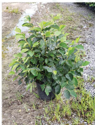
HAMAMELIS VIRGINIANA COMMON WITCHHAZEL

Height: 10 - 15', Foliage: Textured green, Spread: 10 - 12', Fall Foliage: Gold, Zone: 4 - 8, Shape: Round