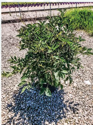
SYRINGA PATULA 'MISS KIM' MISS KIM LILAC

Height: 4 - 5', Foliage: Dark green, Spread: 5 - 7', Fall Foliage: Yellow, Zone: 3 - 7, Shape: Broad, round