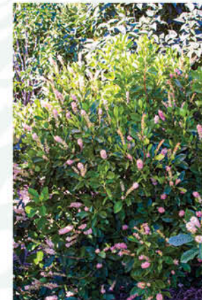
CLETHRA ALNIFOLIA 'RUBY SPICE' RUBY SPICE PINK SUMMERSWEET

Height: 3 - 4', Foliage: Green, Spread: 6 - 8', Fall Foliage: Yellow, Zone: 4 - 9, Shape: Spreading