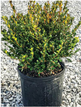
BUXUS MICROPHYLLA 'WINTER GEM' WINTER GEM BOXWOOD

Similar to 'Wintergreen' although may have a slightly richer color.