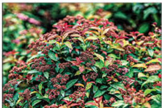
SPIRAEA X BUMALDA 'GOLDFLAME' GOLDFLAME SPIREA

Beautiful bronze-red foliage turning soft yellow. Wonderful pink flowers, good heat tolerance and leaf color make this an ideal selection.