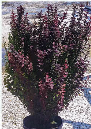
BERBERIS THUNBERGII ATROPURPUREA 'MARSHALL'S UPRIGHT' MARSHALL'S UPRIGHT BARBERRY

Height: 2', Foliage: Burgundy, Spread: 2 - 3', Fall Foliage: Purple-red, Zone: 4 - 7, Shape: Compact, round