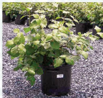
VIBURNUM CARLESII KOREAN SPICE VIBURNUM

Height: 4 - 6', Foliage: Green, Spread: 5 - 8', Fall Foliage: Yellow-orange, Zone: 4 - 7, Shape: Upright