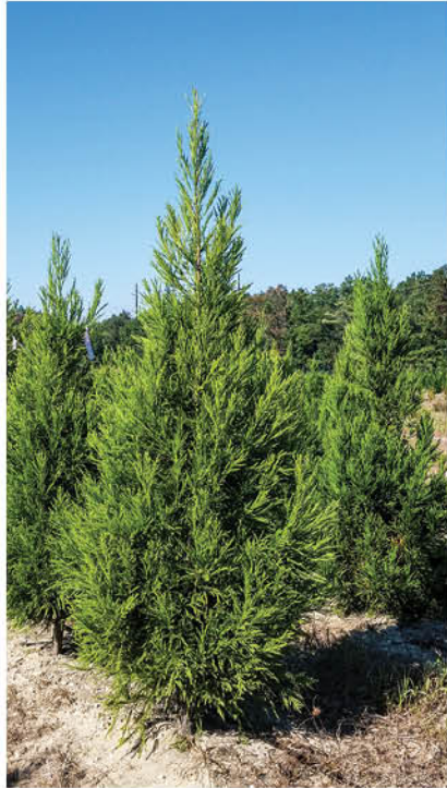
CRYPTOMERIA JAPONICA 'RADICANS' RADICANS CRYPTOMERIA

This cultivar keeps its green color throughout the Winter.