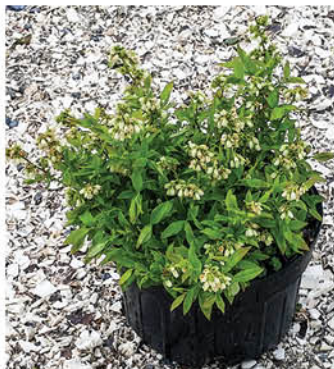
VACCINIUM AUGUSTIFOLIUM LOWBUSH BLUEBERRY

Grows well in acidic, poor soils. Edible berries.