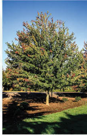
ACER RUBRUM 'RED SUNSET' RED SUNSET MAPLE

Height: 35-40', Foliage: Green, Spread: 15', Fall Foliage: Orange-red, Zone: 3-8