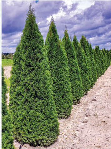
THUJA OCCIDENTALIS 'EMERALD' EMERALD ARBORVITAE

Height: 30 - 40', Foliage: Green, Spread: 30 - 40', Fall Foliage: N/A, Zone: 6 - 8, Shape: Irregular