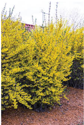
FORSYTHIA INTERMEDIA 'LYNWOOD GOLD' LYNWOOD GOLD FORSYTHIA

Brilliant yellow flowers in early April make this a favorite for borders or mass plantings.