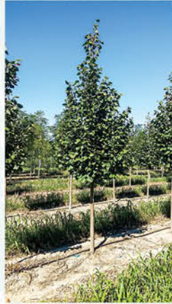
TILIA CORDATA 'GREENSPIRE' GREENSPIRE LINDEN

Height: 40 - 60', Foliage: Glossy green, Spread: 20 - 30', Fall Foliage: Yellow, Zone: 3 - 7, Shape: Pyramidal