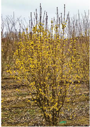
CORNUS MAS 'GOLDEN GLORY' GOLDEN GLORY CORNELIAN DOGWOOD

A truly hardy grower producing massive flowers on an upright growth habit.