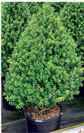
ILEX CRENATA 'STEED'S' STEED'S UPRIGHT HOLLY

Height: 6 - 8', Foliage: Glossy green, Spread: 12", Fall Foliage: N/A, Zone: 5 - 8, Shape: Extremely fastigate