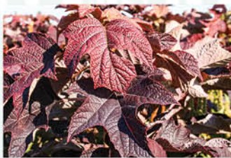
HYDRANGEA QUERCIFOLIA 'SNOW QUEEN' SNOW QUEEN HYDRANGEA

Height: 4 - 6', Foliage: Coarse green, Spread: 3 - 5', Fall Foliage: Red-orange, Zone: 5 - 9, Shape: Upright