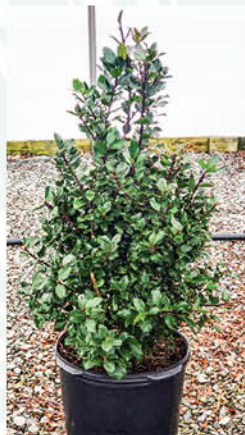
ILEX X MESERVEAE 'BLUE STALLION' BLUE STALLION HOLLY

Height: 10 - 12', Foliage: Blue-green, Spread: 7 - 9', Fall Foliage: Green, Zone: 5 - 9, Shape: Round