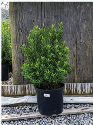
ILEX GLABRA 'SHAMROCK' SHAMROCK COMPACT INKBERRY

Height: 8 - 10', Foliage: Green, Spread: 6 - 8', Fall Foliage: Green, Zone: 4 - 9, Shape: Oval, round