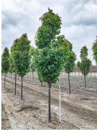
ZELKOVA SERRATA 'MUSASHINO' MUSASHINO ZELKOVA

A new introduction for street tree use. The tight upright canopy useful for streetscapes combined with the hardiness of the Zelkova species makes this an ideal selection.