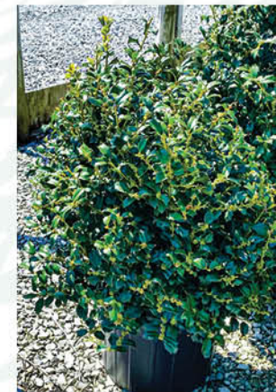
ILEX MESOG 'CHINA BOY' CHINA BOY HOLLY

Height: 3 - 4', Foliage: Green, Spread: 3 - 4', Fall Foliage: Green, Zone: 4 - 9, Shape: Round, upright