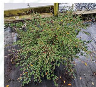
COTONEASTER SALICIFOLIUS 'REPANDENS' WILLOWLEAF COTONEASTER

Height: 1 - 2', Foliage: Rich green, Spread: 4 - 6', Fall Foliage: Red-purple, Zone: 5 - 7, Shape: Prostrate