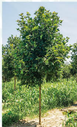
ACER SACCHARUM 'LEGACY' LEGACY SUGAR MAPLE

Height: 50 - 70', Foliage: Green, Spread: 40 - 50", Fall Foliage: Yellow, Orange, Red, Zone: 4 - 7, Shape: Upright, round