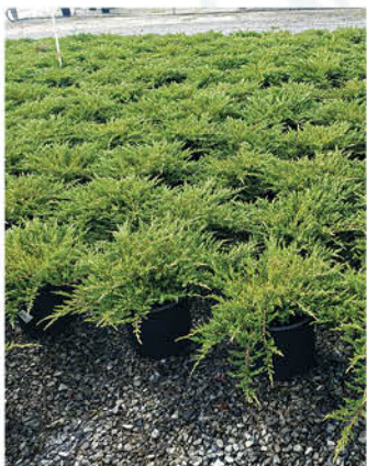
JUNIPERUS CHINENSIS SARGENTII 'VIRIDIS' SARGENT GREEN JUNIPER

Height: 2 - 3', Foliage: Gray green, Spread: 4 - 6', Fall Foliage: N/A, Zone: 3 - 9, Shape: Spreading