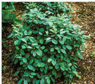
FOTHERGILLA GARDENII 'MOUNT AIRY' MOUNT AIRY DWARF FOTHERGILLA

Height: 8 - 10', Foliage: Glossy green, Spread: 6 - 8', Fall Foliage: Yellow, Zone: 6 - 8, Shape: Upright, spreading