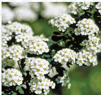
SPIRAEA NIPPONICA 'SNOWMOUND' SNOWMOUND SPIREA

Height: 18", Foliage: Green-red, Spread: 24", Fall Foliage: Red-orange, Zone: 2 - 10, Shape: Round