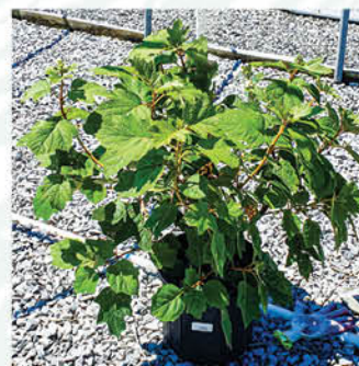
HYDRANGEA QUERCIFOLIA 'ALICE' ALICE HYDRANGEA

Height: 6', Foliage: Glossy green, Spread: 6', Fall Foliage: Orange-scarlet, Zone: 3 - 8, Shape: Round