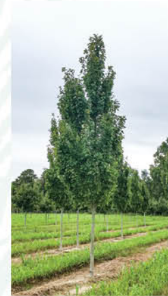
ACER RUBRUM 'ARMSTRONG' ARMSTRONG MAPLE

Height: 15 - 20', Foliage: Vivid green, Spread: 15 - 20', Fall Foliage: Orange-scarlet, Zone: 2 - 8, Shape: Round