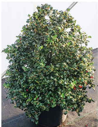
ILEX MESOG 'CHINA GIRL' CHINA GIRL HOLLY

The female form with abundant red berries. More heat tolerant than other species.