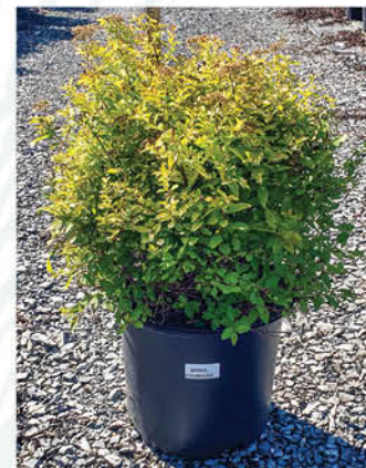
SPIRAEA JAPONICA 'GOLDMOUND' GOLDMOUND SPIREA

Height: 2 - 3', Foliage: Orange-yellow, Spread: 2 - 3', Fall Foliage: Orange-red, Zone: 3 - 8, Shape: Round