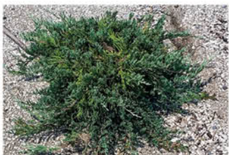
JUNIPERUS HORIZONTALIS 'BAR HARBOR' BAR HARBOR JUNIPER

This prostrate evergreen groundcover adds interesting texture to the landscape while tolerating salty conditions.