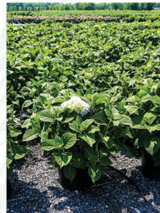
HYDRANGEA MACROPHYLLA 'PENNY MAC' PENNY MAC HYDRANGEA

Height: 4 - 5', Foliage: Glossy green, Spread: 4 - 5', Fall Foliage: Yellow, Zone: 5 - 9, Shape: Round