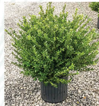
ILEX CRENATA 'COMPACTA' COMPACT JAPANESE HOLLY

Height: 4 - 6', Foliage: Coarse green, Spread: 3 - 5', Fall Foliage: Red-bronze, Zone: 5 - 9, Shape: Upright