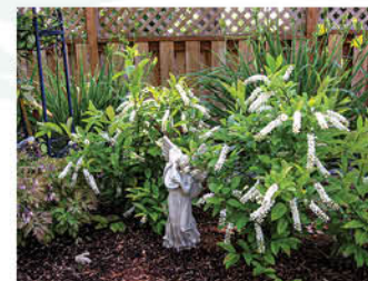
ITEA VIRGINICA 'HENRY'S GARNET' HENRY'S GARNET VIRGINIA SWEETSPIRE

Height: 6 - 9', Foliage: Dark green, Spread: 6 - 8', Fall Foliage: Rich orange, Zone: 4 - 9, Shape: Upright, round