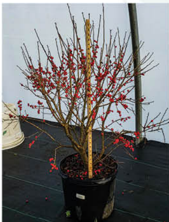
ILEX VERTICILLATA 'RED SPRITE' RED SPRITE WINTERBERRY

This slow growing, large persistent berried dwarf Holly is great in mass plantings and moist soils.