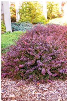
BERBERIS THUNBERGII ATROPURPUREA 'CRIMSON PYGMY' CRIMSON PYGMY BARBERRY

A fantastic selection to create a low growing, colorful hedge.