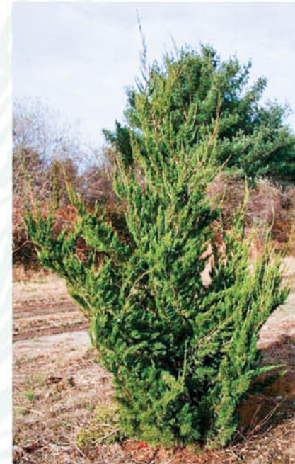
JUNIPERUS CHINENSIS 'TORULOSA' HOLLYWOOD JUNIPER

Height: 15 - 20', Foliage: Green, Spread: 6 - 8', Fall Foliage: Green, Zone: 3 - 9, Shape: Pyramidal