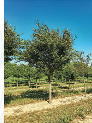
ZELKOVA SERRATA 'VILLAGE GREEN' VILLAGE GREEN ZELKOVA

Height: 45'. Foliage: Green, Spread: 15', Fall Foliage: Rust, Zone: 5 - 8, Shape: Columnar