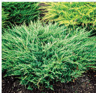
JUNIPERUS HORIZONTALIS PLUMOSA 'YOUNGSTOWN' COMPACT ANDORRA JUNIPER

Height: 12 - 15", Foliage: Blue-gray, Spread: 6 - 8', Fall Foliage: Purple, Zone: 3 - 9, Shape: Spreading