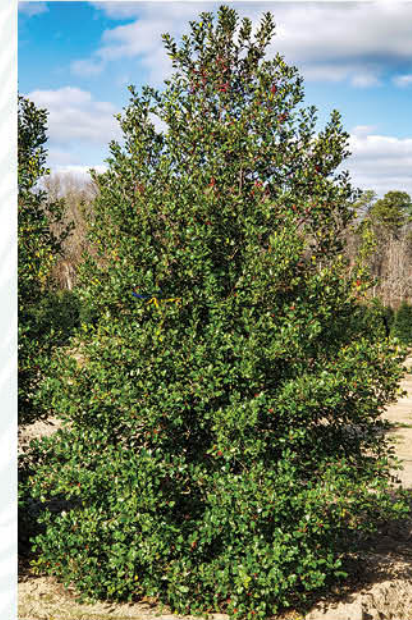
ILEX OPACA 'GREENLEAF' GREENLEAF AMERICAN HOLLY

*FALL DIGGING/ TRANSPLANTING HAZARD SEE PAGE 51