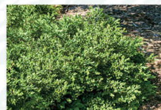
BUXUS 'GREEN VELVET' GREEN VELVET BOXWOOD

Height: 3 - 5', Foliage: Green, Spread: 3 - 4', Fall Foliage: Green, Zone: 5 - 8, Shape: Oval, pyramidal