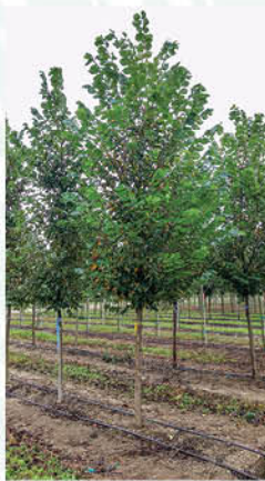
ULMUS AMERICANA 'JEFFERSON' JEFFERSON ELM

Height: 40 - 50', Foliage: Silver-green, Spread: 20 - 30', Fall Foliage: Yellow, Zone: 4 - 7, Shape: Pyramidal