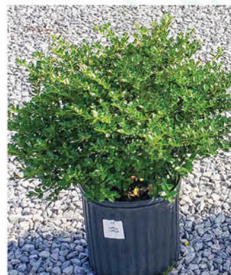
ILEX CRENATA 'GREEN LUSTRE' GREEN LUSTER JAPANESE HOLLY

Height: 6 - 7', Foliage: Glossy green, Spread: 6 - 8', Fall Foliage: N/A, Zone: 6 - 8, Shape: Compact, spreading