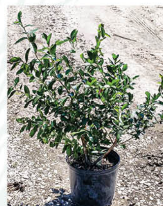
VACCINIUM X BLUE CROP BLUE CROP BLUEBERRY

Height: 4 - 6', Foliage: Green, Spread: 4 - 6', Fall Foliage: Orange-scarlet, Zone: 3 - 6, Shape: Upright Height: 3', Foliage: Green, Spread: 3', Fall Foliage: Red, Zone: 2 - 6, Shape: Low, spreading