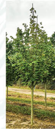
TILIA TOMENTOSA 'GREEN MOUNTAIN' GREEN MOUNTAIN SILVER LINDEN

Height: 40 - 50', Foliage: Green, Spread: 30 - 40', Fall Foliage: Yellow, Zone: 3 - 7, Shape: Oval