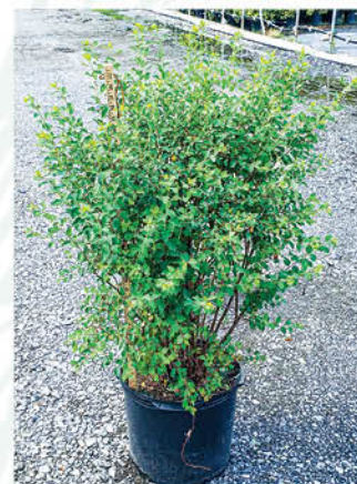
SPIRAEA X VANHOUTTEI VANHOUTTE SPIREA

Height: 3 - 5', Foliage: Blue-green, Spread: 3 - 4', Fall Foliage: Yellow, Zone: 3 - 8, Shape: Compact upright