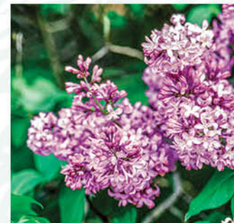
SYRINGA VULGARIS COMMON LILAC

Height: 6 - 7', Foliage: Blue-green, Spread: 5 - 6', Fall Foliage: Red, Zone: 3 - 7, Shape: Upright