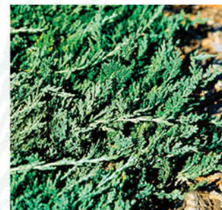
JUNIPERUS HORIZONTALIS 'WILTONI' BLUE RUG JUNIPER

Height: 15 - 18", Foliage: Green, Spread: 4 - 6', Fall Foliage: Bronze, Zone: 3 - 9, Shape: Spreading