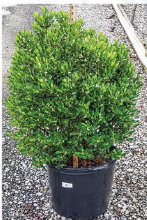
ILEX GLABRA 'DENSE' DENSE INKBERRY

Height: 4 - 6', Foliage: Glossy green, Spread: 6 - 8', Fall Foliage: Green Zone: 4 - 9, Shape: Round