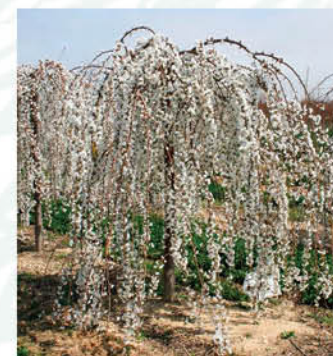
PRUNUS X 'SNOW FOUNTAINS' SNOW FOUNTAINS CHERRY

Height: 25 - 30', Foliage: Green, Spread: 20 - 25', Fall Foliage: Maroon, Zone: 2 - 7, Shape: Round