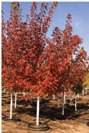
ACER RUBRUM 'AUTUMN BLAZE' AUTUMN BLAZE RED MAPLE

Height: 50 - 70', Foliage: Green with a silver underside, Spread: 15', Fall Foliage: Orange-red, Zone: 3 - 8, Shape: Fastigate