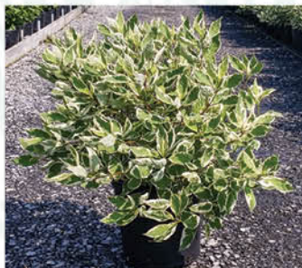
CORNUS ALBA 'ARGENTEO-MARGINATA' VARIEGATED DOGWOOD

Height: 3 - 4', Foliage: Green, Spread: 3 - 4', Fall Foliage: Yellow, Zone: 3 - 7, Shape: Upright