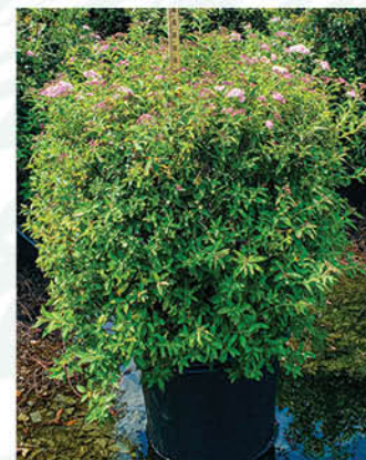
SPIRAEA JAPONICA 'SHIROBANA' SHIROBANA SPIREA

Height: 3 - 4', Foliage: Green, Spread: 3 - 4', Fall Foliage: Yellow, Zone: 4 - 8, Shape: Round