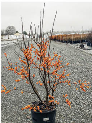
ILEX VERTICILLATA 'WINTER GOLD' WINTER GOLD WINTERBERRY

Height: 10 - 12', Foliage: Dark green, Spread: 8 - 10', Fall Foliage: Yellow, Zone: 4 - 9, Shape: Upright, round