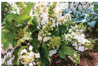
HYDRANGEA QUERCIFOLIA OAKLEAF HYDRANGEA

Dark green shaped leaf shrub with large, white flowers turning pink in Fall.