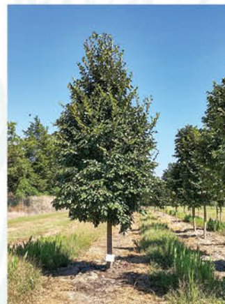
ULMUS CARPINIFOLIA 'ACCOLADE' ACCOLADE SMOOTHLEAF ELM

Height: 60 - 80', Foliage: Green, Spread: 30 - 60', Fall Foliage: Yellow, Zone: 3 - 9, Shape: Vase