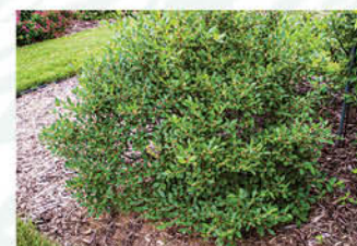
ILEX VERTICILLATA JIM DANDY' JIM DANDY WINTERBERRY

Height: 10 - 12', Foliage: Blue-green, Spread: 7 - 9', Fall Foliage: Green, Zone: 5 - 9, Shape: Round