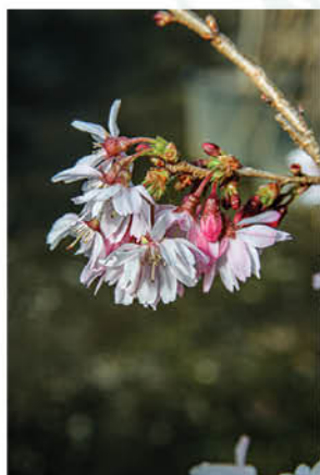
PRUNUS SUBHIRTELLA 'AUTUMNALIS' AUTUMN FLOWERING CHERRY

Height: 25 - 35', Foliage: Bronze-green, Spread: 15 - 20', Fall Foliage: Bronze, Zone: 5 - 9, Shape: Upright