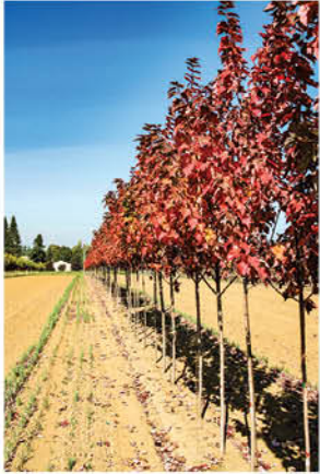
ACER RUBRUM 'RED ROCKET' RED ROCKET MAPLE

Narrow upright Maple. Tight as Bowhall but slower growing.