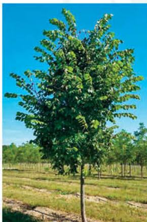
ULMUS AMERICANA 'VALLEY FORGE' VALLEY FORGE ELM

The ultimate American Elm canopy. This US Arboretum introduction offers a broad, dense canopy while exhibiting excellent disease resistance.