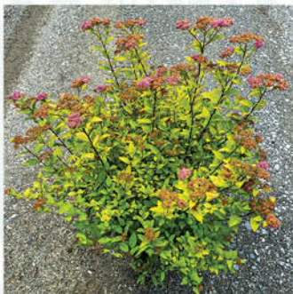
SPIRAEA JAPONICA 'FIRELIGHT' FIRELIGHT SPIREA

Height: 3 - 4', Foliage: Yellow, Spread: 3 - 4', Fall Foliage: Yellow, Zone: 3 - 8, Shape: Round