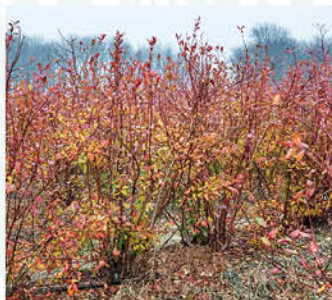
VACCINIUM CORYMBOSUM HIGHBUSH BLUEBERRY

Grows well in acidic, poor soils. Edible berries.