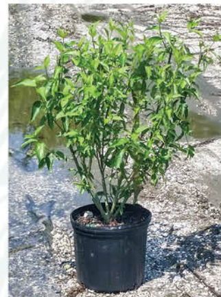
CORNUS AMOMUM SILKY DOGWOOD

Height: 6 - 8', Foliage: Variegated cream and green, Spread: 4 - 5', Fall Foliage: Red-purple, Zone: 2 - 7, Shape: Erect, round