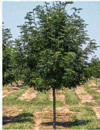
GLEDITSIA TRIACANTHOS INERMIS 'SKYLINE' SKYLINE LOCUST

Height: 30 - 40', Foliage: Green, Spread: 30 - 40', Fall Foliage: Yellow, Zone: 4 - 9, Shape: Round