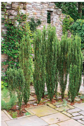
ILEX CRENATA 'SKY PENCIL' SKY PENCIL HOLLY

Dense upright habit covered with dark green leaves. Will create a nice hedge.