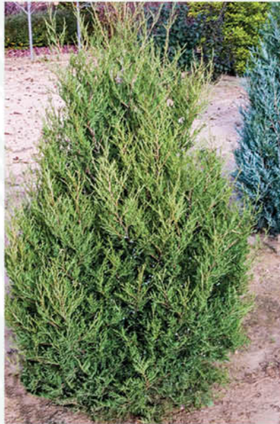
JUNIPERUS CHINENSIS 'SPARTAN' SPARTAN JUNIPER

Height: 12 - 15', Foliage: Green w/ Yellow, Spread: 6 - 8', Fall Foliage: N/A, Zone: 4 - 9, Shape: Irregular