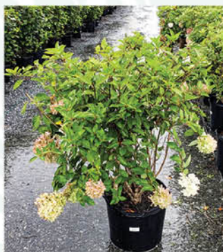
HYDRANGEA PANICULATA 'COMPACT' COMPACT PEE GEE HYDRANGEA

Height: 3 - 5', Foliage: Green, Spread: 3 - 5', Fall Foliage: Burgundy, Zone: 4 - 9, Shape: Upright, round