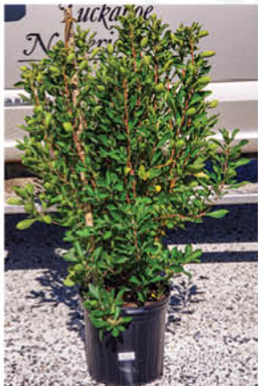
CLETHRA ALNIFOLIA SUMMERSWEET

Height: 2 - 3', Foliage: Silver, Spread: 2 - 3', Fall Foliage: Brown, Zone: 6 - 9, Shape: Round