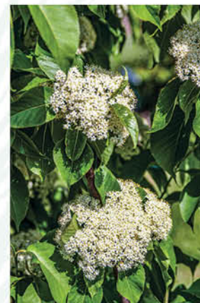
VIBURNUM LENTAGO NANNYBERRY VIBURNUM

Height: 7 - 8', Foliage: Green, Spread: 7 - 10', Fall Foliage: Purple-red, Zone: 3 - 7, Shape: Round, upright