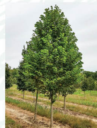
ULMUS AMERICANA 'PRINCETON' PRINCETON AMERICAN ELM

Height: 60 - 70', Foliage: Green, Spread: 40 - 50', Fall Foliage: Yellow, Zone: 4 - 9, Shape: Vase