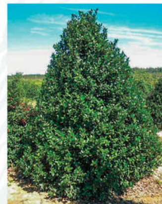
ILEX X MESERVEAE 'BLUE PRINCESS' BLUE PRINCESS HOLLY

Height: 10 - 12', Foliage: Blue-green, Spread: 6 - 8', Fall Foliage: Green, Zone: 5 - 9, Shape: Pyramidal