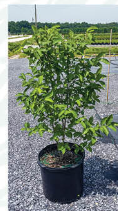
LINDERA BENZOIN SPICEBUSH

Height: 10 - 15', Foliage: Green, Spread: 8 - 10', Fall Foliage: N/A, Zone: 5 - 7, Shape: Upright