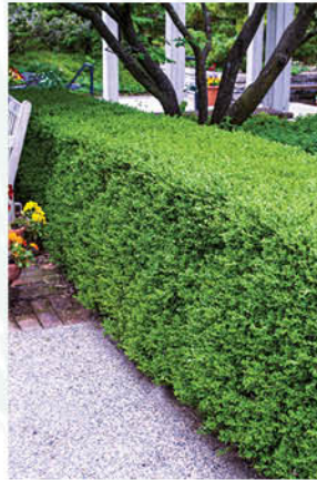
BUXUS MICROPHYLLA 'WINTERGREEN' WINTER GREEN BOXWOOD

Height: 2', Foliage: Green, Spread: 2', Fall Foliage: Green, Zone: 6 - 9, Shape: Round