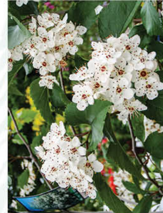
CRATAEGUS VIRIDIS 'WINTER KING' WINTER KING HAWTHORN

Height: 15 - 20', Foliage: Green, Spread: 20 - 30', Fall Foliage: Purple, Zone: 5 - 8, Shape: Round