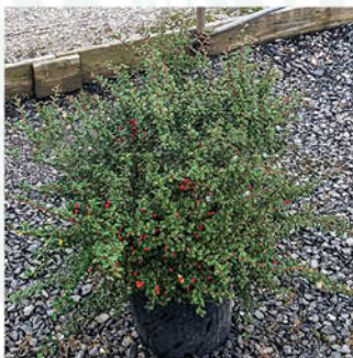
COTONEASTER DAMMERI 'CORAL BEAUTY' CORAL BEAUTY COTONEASTER

Height: 2 - 3', Foliage: Green, Spread: 2 - 3', Fall Foliage: Yellow, Zone: 5 - 7, Shape: Compact