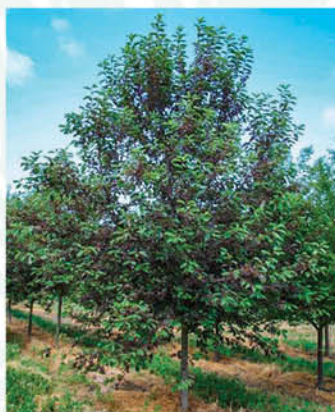
PRUNUS VIRGINIANA 'CANADA RED' CANADA RED CHOKECHERRY

Height: 20 - 35', Foliage: Green, Spread: 15 - 30', Fall Foliage: Yellow, Zone: 5 - 8, Shape: Upright