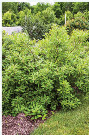
ILEX VERTICILLATA 'SOUTHERN GENTLEMAN' SOUTHERN GENTLEMAN WINTERBERRY

Height: 3 - 5', Foliage: Green, Spread: 3 - 5', Fall Foliage: Yellow, Zone: 3 - 9, Shape: Round