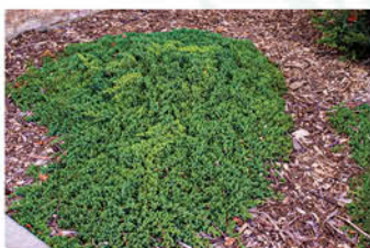
JUNIPERUS PROCUMBENS 'NANA' DWARF JAPANESE GARDEN JUNIPER

Height: 4 - 8", Foliage: Blue-green, Spread: 6 - 8', Fall Foliage: Purple, Zone: 3 - 9, Shape: Spreading