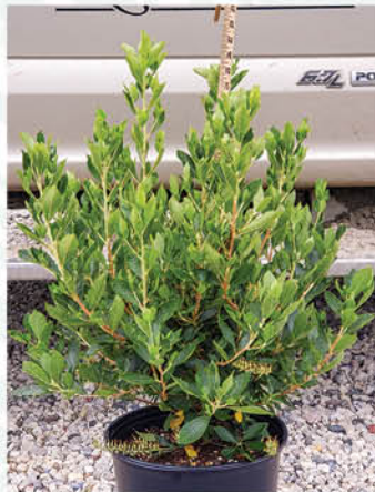
CLETHRA ALNIFOLIA 'HUMMINGBIRD' HUMMINGBIRD SUMMERSWEET

Height: 4 - 8', Foliage: Green, Spread: 4 - 6', Fall Foliage: Yellow, Zone: 4 - 9, Shape: Upright