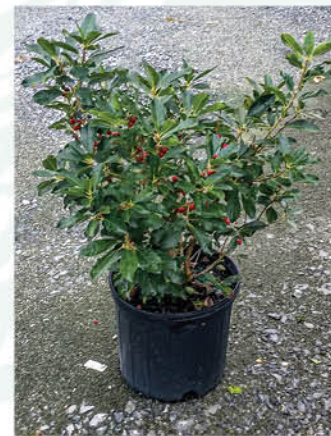
ILEX VERTICILLATA 'SPARKLEBERRY' SPARKLEBERRY WINTERBERRY

Height: 6 - 10', Foliage: Green, Spread: 6 - 10', Fall Foliage: Yellow, Zone: 3 - 9, Shape: Oval