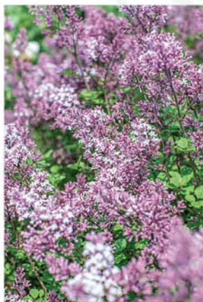
SYRINGA MEYERI DWARF KOREAN LILAC

Height: 6 - 8', Foliage: Blue-green, Spread: 10 - 12', Fall Foliage: Yellow, Zone: 3 - 8, Shape: Mound, descending