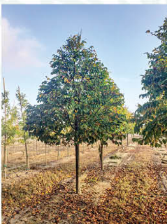
ULMUS WILSONIANA 'PROSPECTOR' PROSPECTOR ELM

Height: 60 - 80', Foliage: Green, Spread: 50 - 60', Fall Foliage: Yellow, Zone: 4 - 9, Shape: Upright