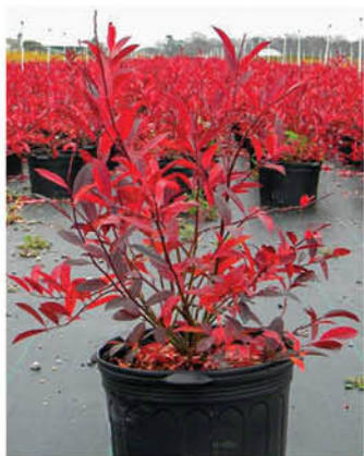
ITEA VIRGINICA 'MERLOT' MERLOT VIRGINIA SWEETSPIRE

Introduced for a more compact, more intense red Fall color. Ideal replacement for Little Henry Itea.