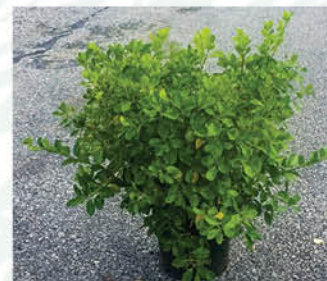
EUONYMUS KIAUTSCHOVICUS 'MANHATTAN' MANHATTAN EUONYMUS

Height: 6 - 8', Foliage: Green, Spread: 6 - 8', Fall Foliage: Crimson, Zone: 5 - 8, Shape: Round