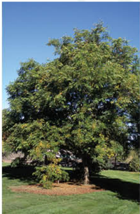
GLEDITSIA TRIACANTHOS INERMIS 'HALKA' HALKA LOCUST

Height: 30 - 40', Foliage: Green, Spread: 30 - 40', Fall Foliage: Yellow, Zone: 4 - 9, Shape: Round