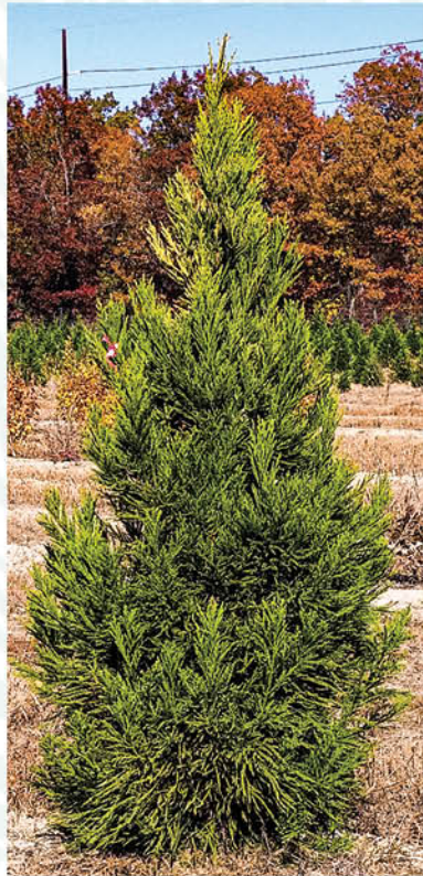
CRYPTOMERIA JAPONICA 'YOSHINO' YOSHINO JAPANESE CRYPTOMERIA

Height: 50 - 60', Foliage: Green-blue, Spread: 20 - 30', Fall Foliage: Green-blue, Zone: 5 - 7, Shape: Pyramidal