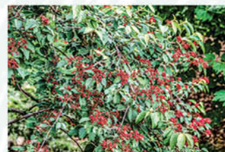
VIBURNUM PLICATUM 'MARIESII' MARIESI VIBURNUM

Height: 5 - 7', Foliage: Green, Spread: 5 - 7', Fall Foliage: Red-purple Zone: 5 - 9, Shape: Round