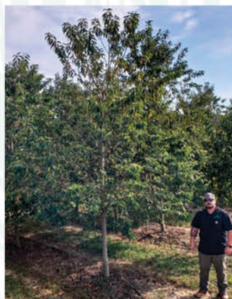
PRUNUS SEROTINA BLACK CHERRY

Height: 20 - 25', Foliage: Green, Spread: 15 - 20', Fall Foliage: Yellow, Zone: 4 - 8, Shape: Weeping