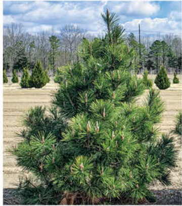
PINUS THUNBERGIANA JAPANESE BLACK PINE

A salt tolerant, long needled Pine which grows somewhat irregularly, but makes a nice specimen.