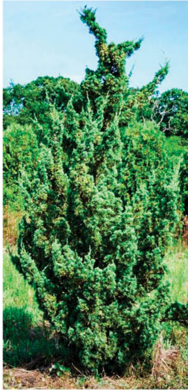
JUNIPERUS CHINENSIS 'ROBUSTA GREEN' ROBUSTA GREEN JUNIPER

Irregular form with rich green foliage and abundant cones.