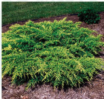
JUNIPERUS CHINENSIS 'OLD GOLD' OLD GOLD JUNIPER

Height: 3', Foliage: Green, Spread: 3', Fall Foliage: Red, Zone: 5 - 9, Shape: Round