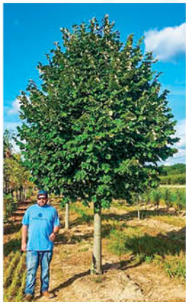
TILIA TOMENTOSA 'STERLING SILVER' STERLING SILVER LINDEN

Height: 40 - 60', Foliage: Silver-green, Spread: 25 - 30' Fall Foliage: Yellow, Zone: 4 - 7, Shape: Pyramidal