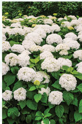
HYDRANGEA ARBORESCENS 'ANNABELLE' ANNABELLE HYDRANGEA

Height: 20 - 30', Foliage: Green, Spread: 20 - 25', Fall Foliage: Yellow, Zone: 3 - 8, Shape: Round