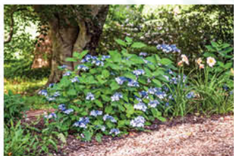
HYDRANGEA MACROPHYLLA 'TWIST-N-SHOUT' TWIST-N-SHOUT HYDRANGEA

Height: 4 - 6', Foliage: Green, Spread: 4 - 5', Fall Foliage: Burgundy, Zone: 5 - 9, Shape: Upright, round