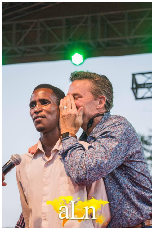
This man was deaf in his left ear. I am whispering to test if he can hear me.