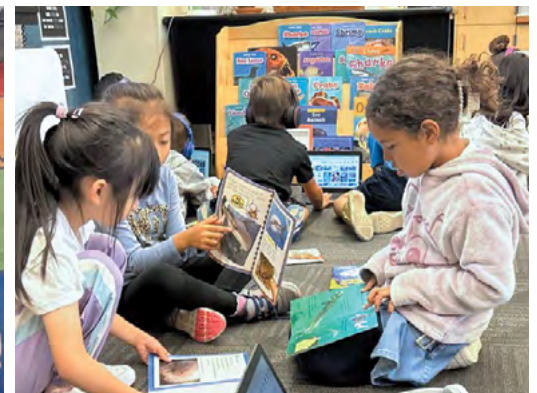
Students identifying author's craft moves in mentor texts