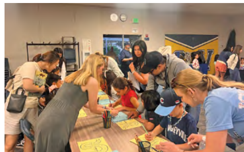
Literacy activities to end out the night