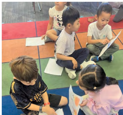
Kindergarten students reading aloud their writing with partners