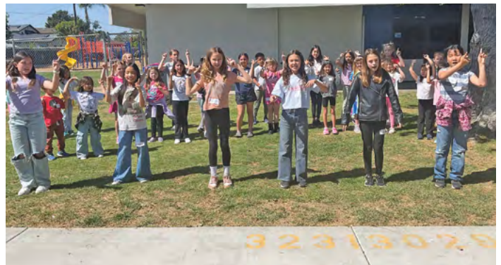
Students hard at work at rehearsal

Our inaugural production promises to make a splash and create lasting memories for all!