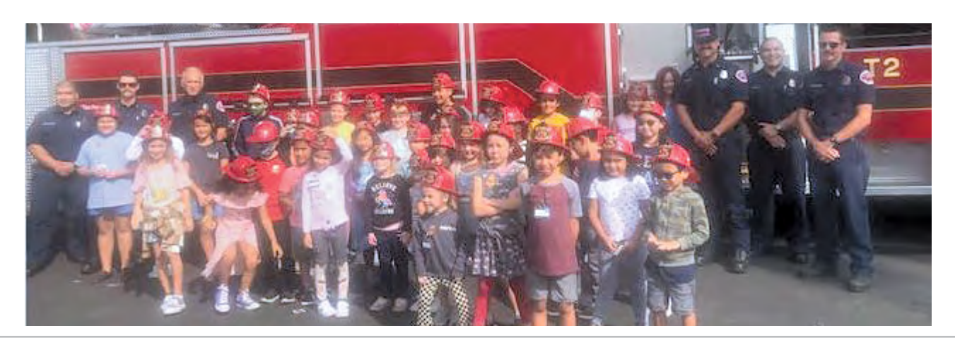
Rio Vista Elementary School (TK-5)

They also demonstrated how to use lifesaving tools and had a race between two firefighters, showing how they have one minute to get their gear on for an emergency call. Before leaving, each student eagerly received a red fire hat, stickers, and had the special opportunity to sit in the fire truck. We thank our local heroes for the work they do and the time they spent with us at Parkview.