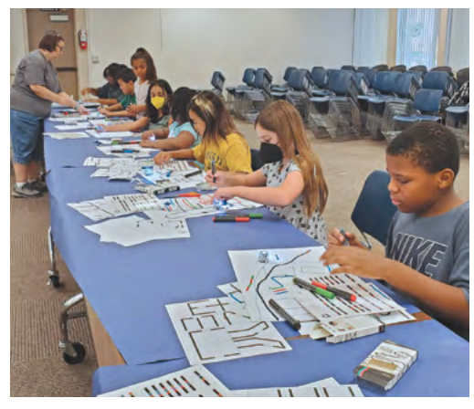
Teacher Supported Student Centered Learning at BVVA