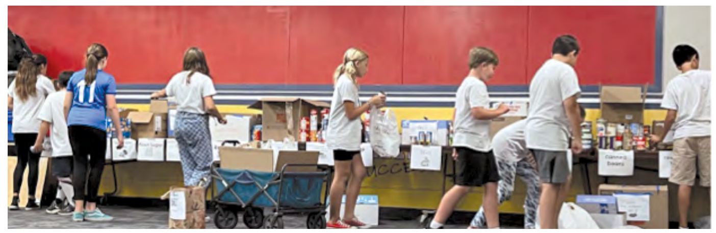
Student leaders at Sierra Vista help to organize over 1000 donated food items during the school's Food Drive.

video to share with each class about what items to bring to school. They traveled to each classroom to collect and sort items that were donated. The generous families at Sierra Vista donated cereal, oatmeal, canned goods, rice, and much more. In total, over 1000 items were collected and taken to the Family Resource Center to be distributed to the neediest families throughout our district. Way to go, Eagles!