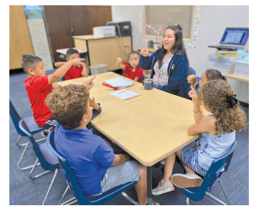
Students use kinesthetic learning techniques to practice writing in their small intervention group.

(AST) and two Response to Intervention (RtI) teachers are working closely with classroom teachers and our Instructional Coach to tailor data-driven interventions targeted to gaps in specific skills. Our Intervention Team is already showing great progress, and our students are highly engaged in their smallgroup instruction. We are incorporating PYLUSD Signature Practices and AVID instructional strategies in these groups as well as across the campus in every classroom. At Rio Vista, we believe that ALL means ALL, and we will continue to invest in meeting the needs of every student!