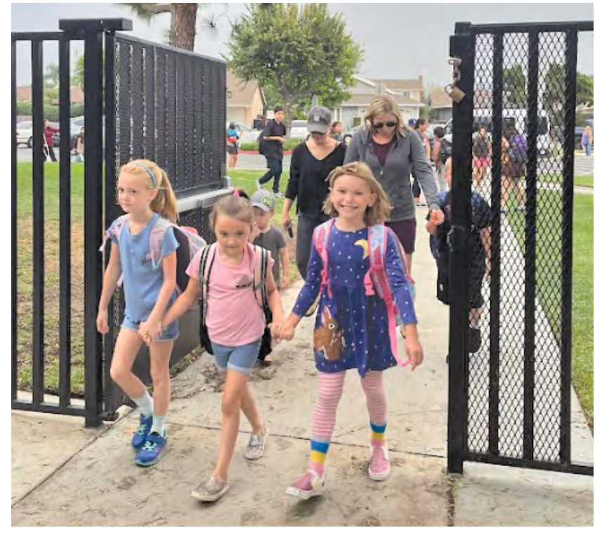
Glenview students and families celebrating "Walk and Roll" to School Day.

On Wednesday, October 12, we celebrated National Walk and Roll to School Day. The campus was open to families and that morning, students and their loved ones were able to walk and talk together on the blacktop. We are looking forward to many fun events and opportunities to engage with our community this year!