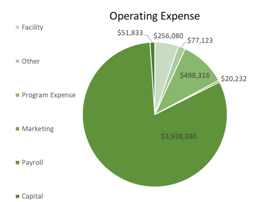
Figure 2. Program Expense Facility: $256,080 (6%) Other: $77,123 (1%)