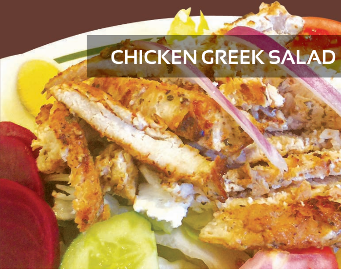
CHICKEN GREEK SALAD