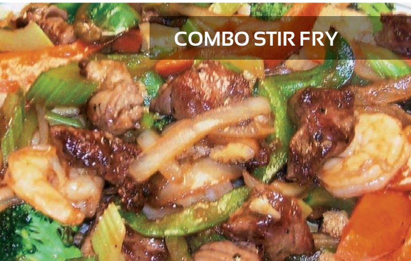
COMBO STIR FRY