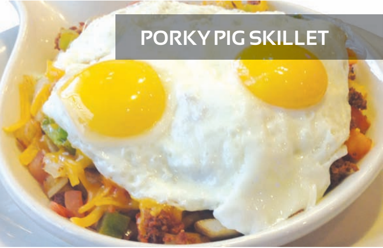
PORKY PIG SKILLET