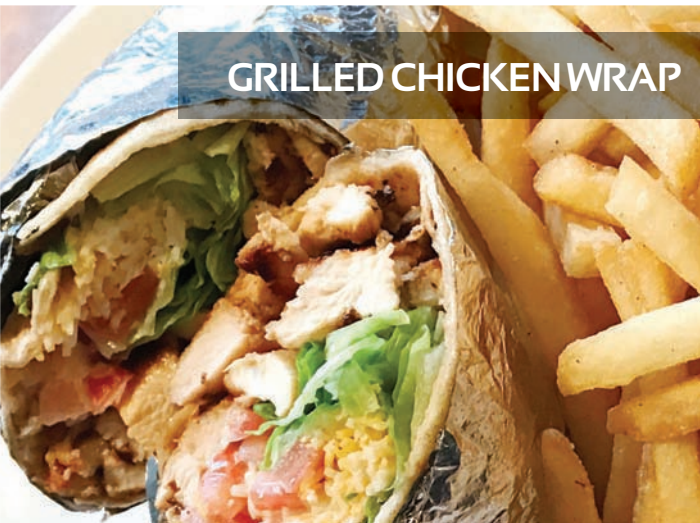
GRILLED CHICKEN WRAP