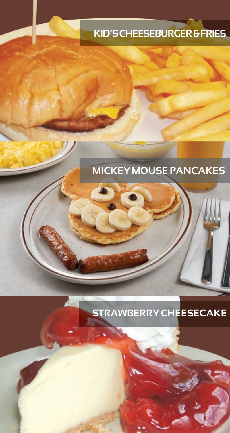
KID’S CHEESEBURGER & FRIES