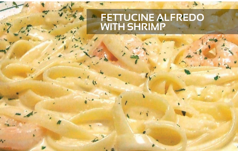
FETTUCINE ALFREDO WITH SHRIMP