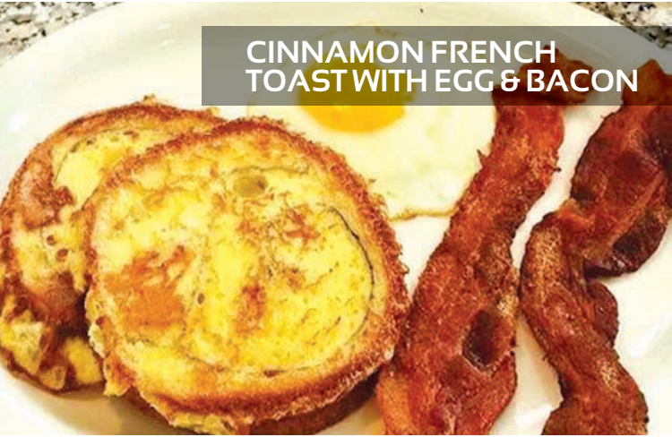
CINNAMON FRENCH TOAST WITH EGG & BACON