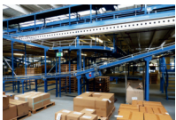
Custom Procurement Solutions