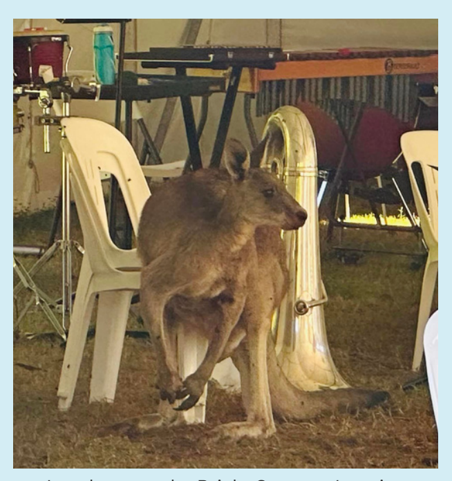
Interloper at the Bright Summer Intesive