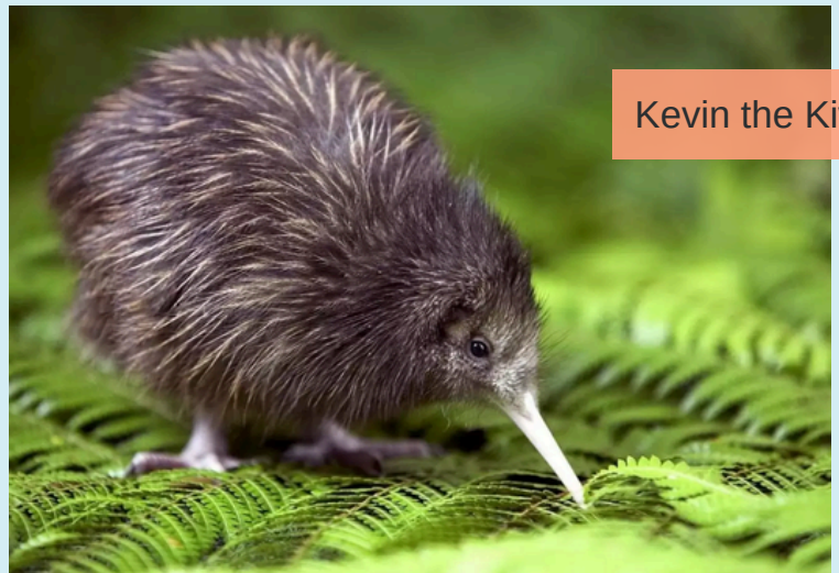
Kevin the Kiwi

If you are taking an instrument on tour that is owned by your band or school, we recommend that you speak to your band committee or school teacher about their requirements for travel insurance.