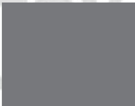
402 DARK GRAY