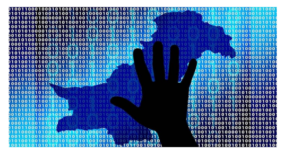
Pakistan Government Calls it's Cyber Security Team Incompetent