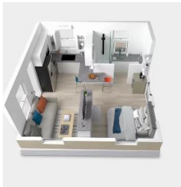
BOXABL CASITA – Accessory Dwelling Unit