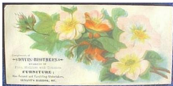
From Davis Brothers Furniture in Tenants Harbor