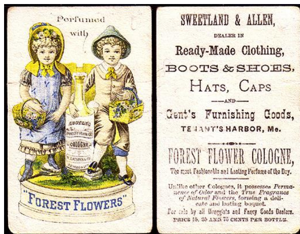
From the Sweetland & Allen Store in Tenants Harbor