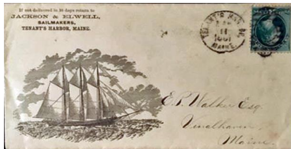
Jackson & Elwell Sailmakers in Tenants Harbor