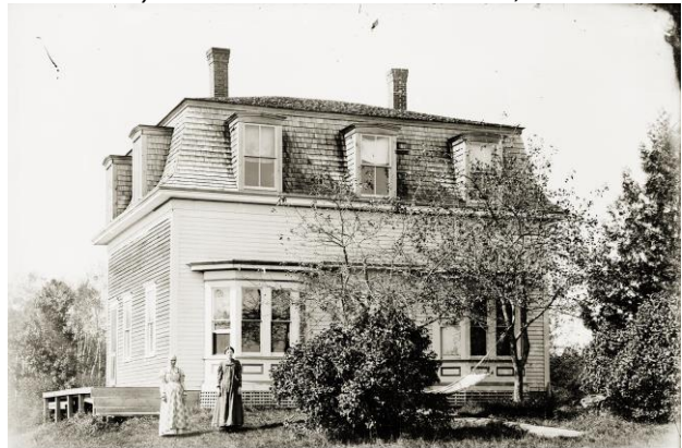
From our collection of 1898 glass negatives