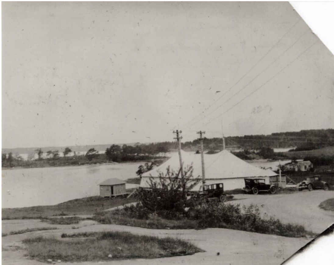
Photo of the Ding Dong – located in Smalleytown near the intersection of Wallston Road and Smalleytown Road