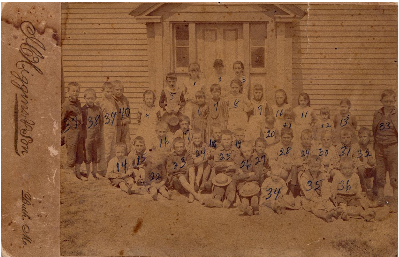
(from Willard Hilt Collection - courtesy of Jim Skoglund - School at Wiley's Corner – circa 1887)