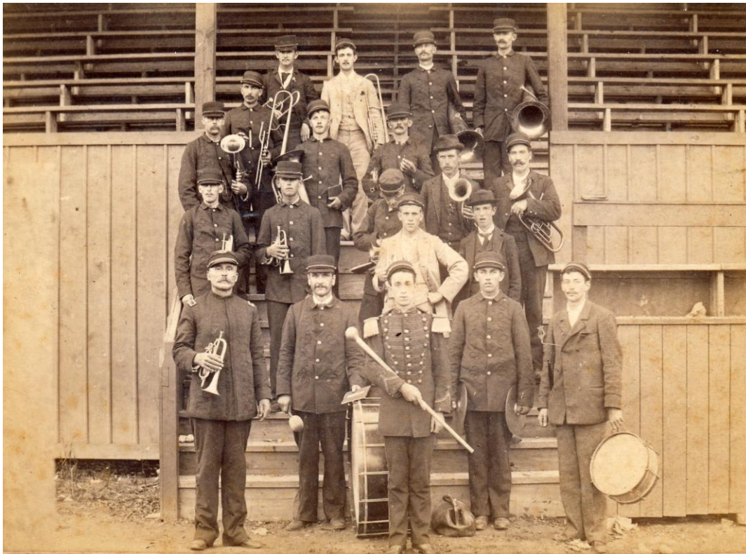
( St George Band at Thomaston Trotting Park)