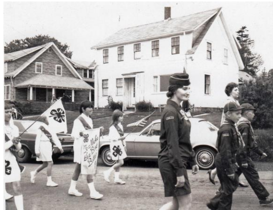
Another Parade picture