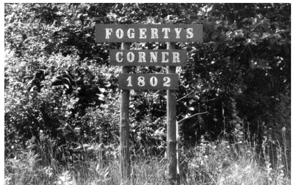
Old Road Sign