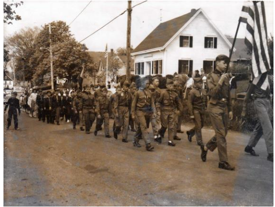
Memorial Day Parade – what year?