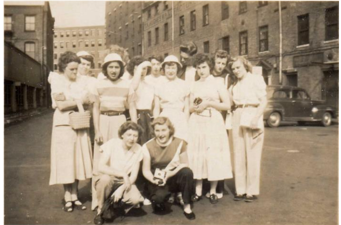
Class trip to Boston