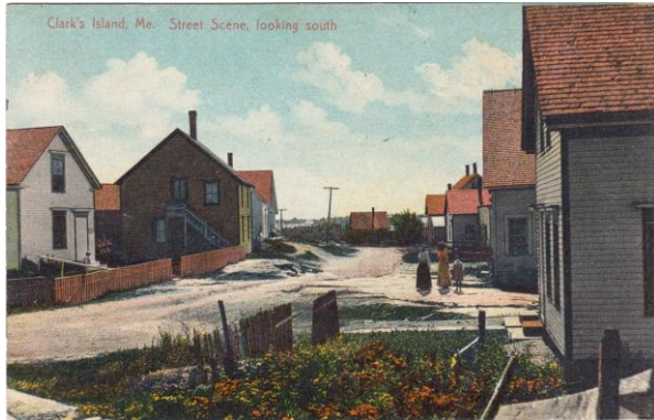
Clark Island street scene – looking south