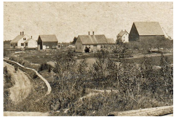
(Close up from a real photo postcard from ca. 1900)