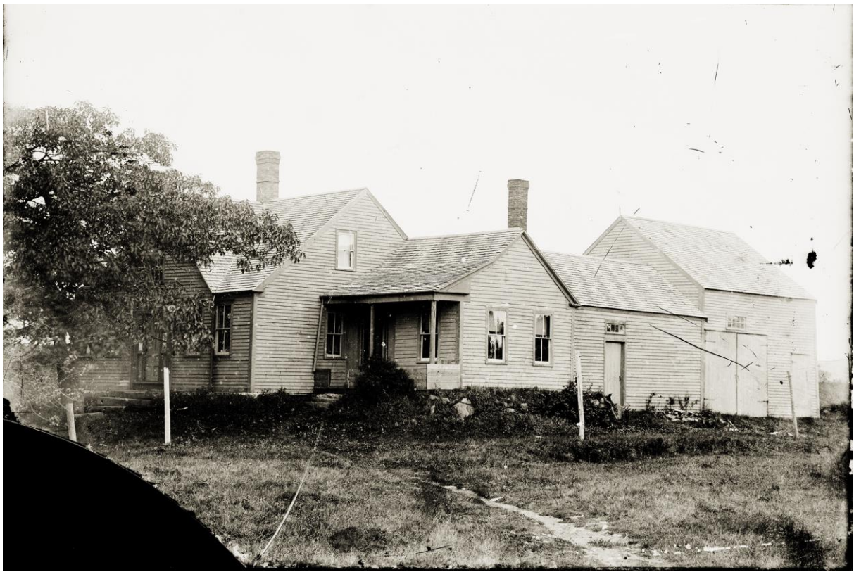
56 Watts Avenue