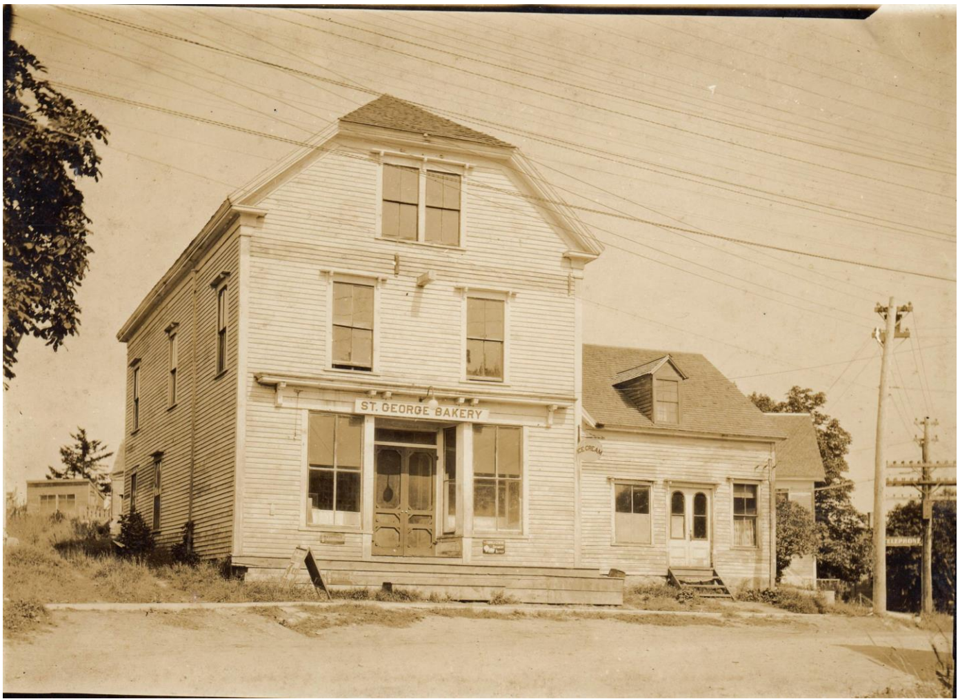
Across from Tenants Harbor General Store parking lot