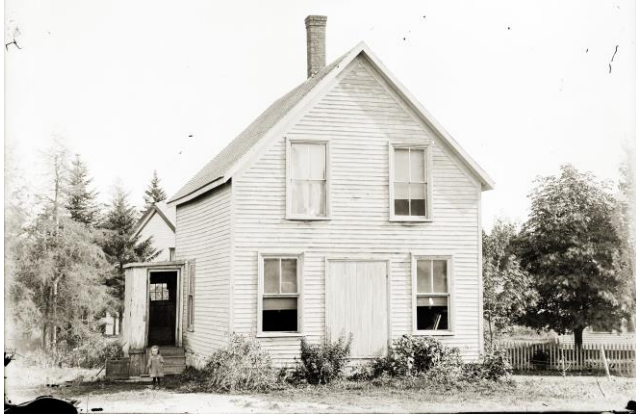
Corner of Watts Avenue & Main Street