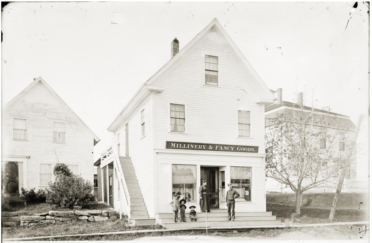
Across from the Tenants Harbor Post Office