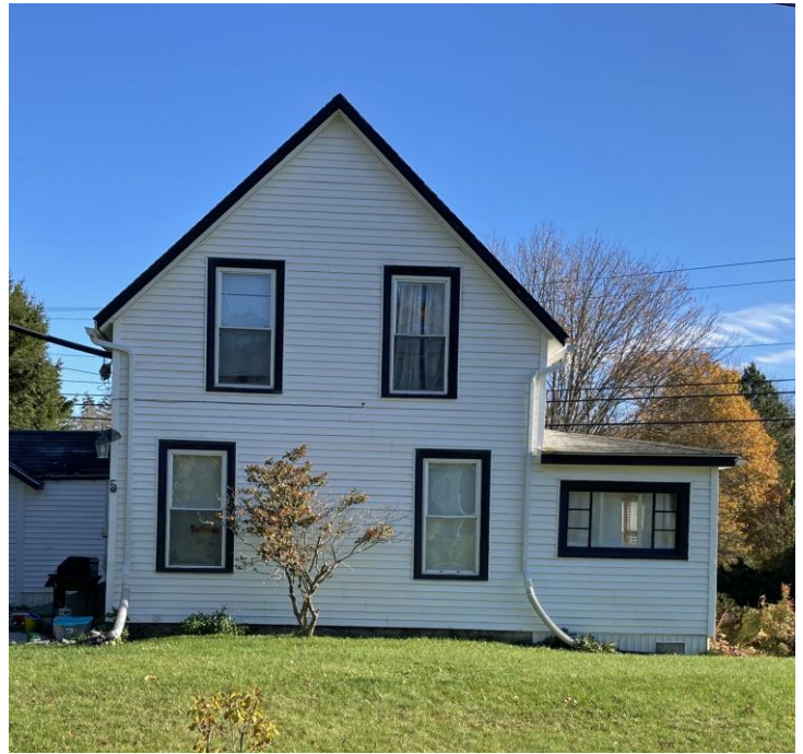
11 Watts Avenue