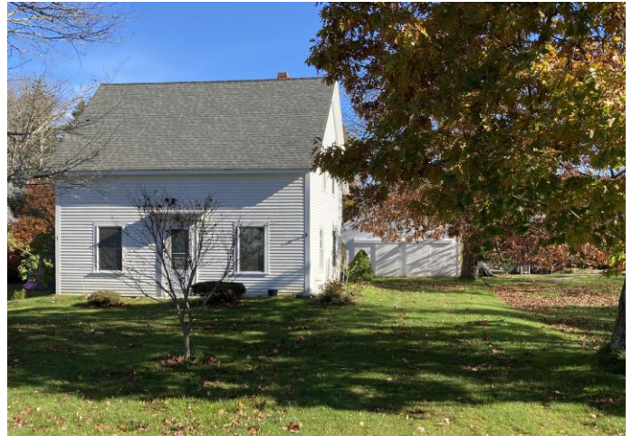
111 Watts Avenue