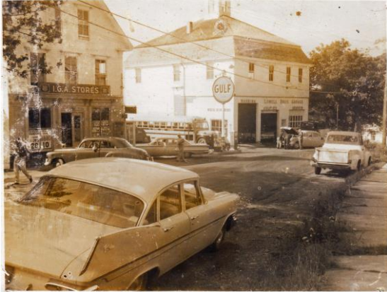
Halls Market to the left and Lowell Brothers Garage on the right