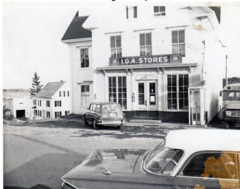
Halls Market exterior before new entrance