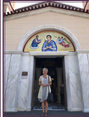
saint john the russian church, evia island