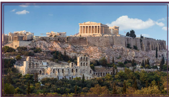
tour acropolis, athens

EXPERIENCE GREEK HISTORY, CULTURE AND CUISINE ON THIS S-L-O-W TOUR OF OUR CORNER OF GREECE