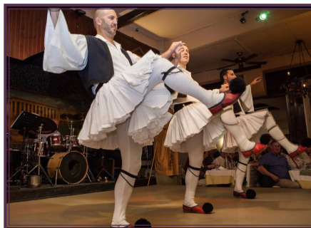
greek dancing dinner show