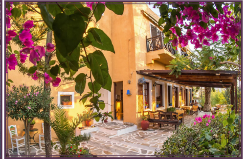
vagia traditional greek hotel, aegina island

DWELL IN ANCIENT MONASTERIES & CHURCHES SOAK IN THE BEAUTY OF GOD'S HOLY HOUSE