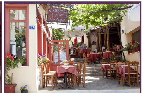
meander in plaka pedestrian zone