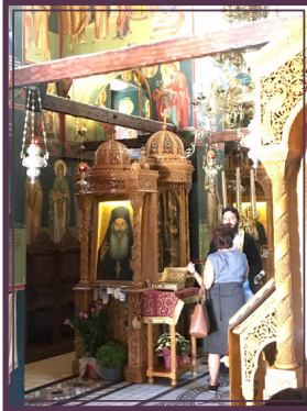
saint iakovos / saint david monastery, evia island