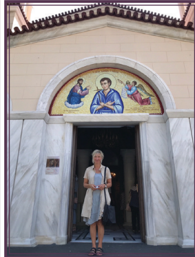
saint john the russian church, evia island