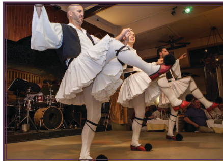
greek dancing dinner show