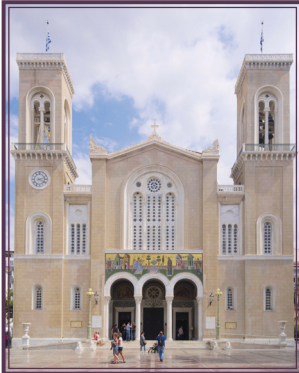
metropolitan cathedral athens

DWELL IN ANCIENT MONASTERIES AND CHURCHES SOAK IN THE BEAUTY OF GOD'S HOLY HOUSE