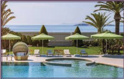
world class apollo divani spa, athens

TAKE THE HEALING WATERS WITH SPA TREATMENTS AND THALASSO THERAPY ALONG THE WAY