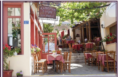
meander in plaka pedestrian zone