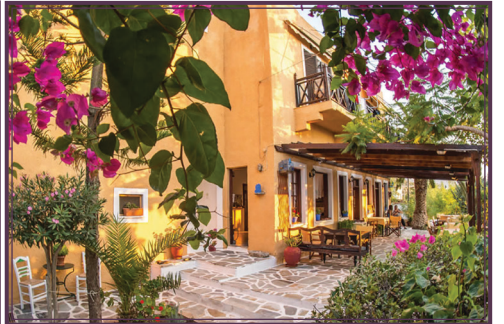
vagia traditional greek hotel, aegina island

DWELL IN ANCIENT MONASTERIES AND CHURCHES SOAK IN THE BEAUTY OF GOD'S HOLY HOUSE