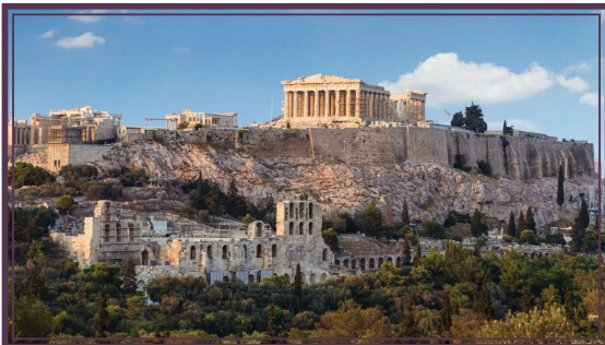
tour acropolis, athens

EXPERIENCE GREEK HISTORY, CULTURE AND CUISINE ON THIS S-L-O-W TOUR OF OUR CORNER OF GREECE