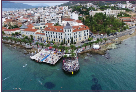
five-star thermae sylla spa hotel, evia island