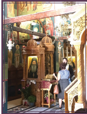
saint iakovos / saint david monastery, evia island