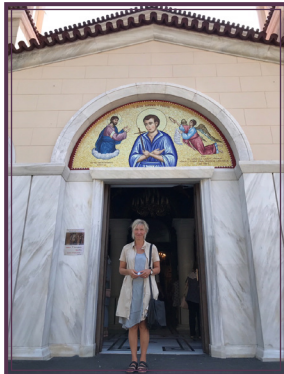
saint john the russian church, evia island