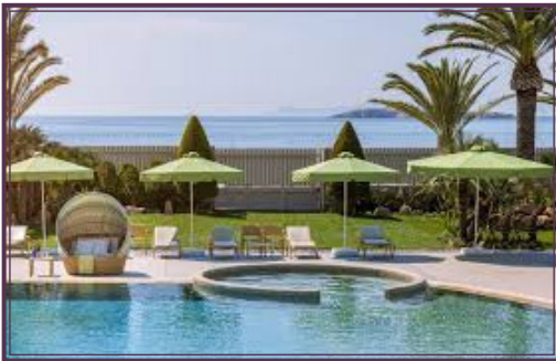
world class apollo divani spa, athens

TAKE THE HEALING WATERS WITH SPA TREATMENTS AND THALASSO THERAPY ALONG THE WAY