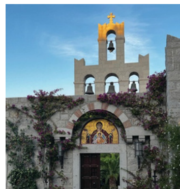
Evangelismos women's monastery

Share in daily gatherings • Pray in St. John's cave • Contemplative walking on ancient footpaths • Make a handmade prayer journal • Venerate relics on Leros Island • Fall in love with your prayer life • Small group of up to 20 pilgrims