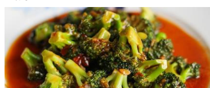
BROCCOLI W/ GARLIC SAUCE 13.95