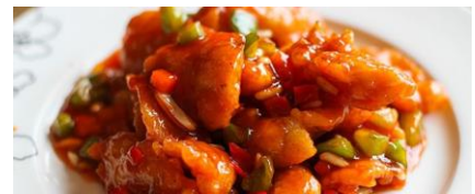
SWEET & SOUR CHICKEN 17.95 / 19.95