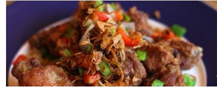
SALT & PEPPER PORK RIB 椒盐排骨 20.95 / 22.95

* Consuming raw or undercooked meat, poultry; seafood or egg may increase your risk of food-borne illnesses.