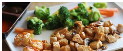
HIBACHI CHICKEN Served w/shrimp, mushrooms & seasonal vegetables 19.95 / 21.95