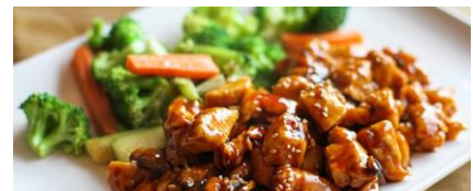
TERIYAKI CHICKEN Homemade teriyaki sauce. Served w/ mixed vegetables 17.95 / 19.95