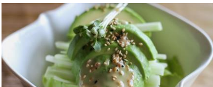
AVOCADO & CUCUMBER SALAD Sesame dressing 10.95