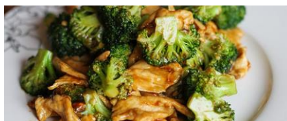
CHICKEN W/BROCCOLI WITH BLACK BEAN 17.95 / 21.95