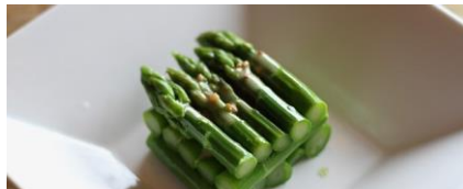
STEAMED ASPARAGUS W/JAPANESE SESAME DRESSING 9.95