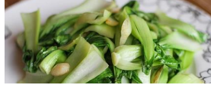
BOK CHOY W/FRESH GARLIC Chinese classic style 13.95