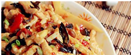
SHREDDED PORK W/ GARLIC SAUCE 鱼香肉丝 19.95 / 21.95