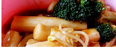
PORK W STICKY RICE NOODLES 肉炒年糕 18.95 / 20.95