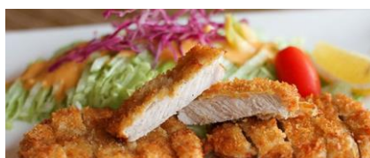
CHICKEN KATSU Japanese-style chicken cutlet served w/ton katsu sauce & shredded lettuce 18.95 / 20.95