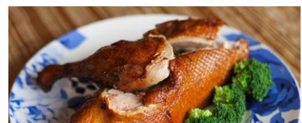
SMOKED DUCK Served w/ broccoli 29 / 60