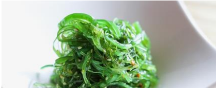
SEAWEED (Hiyashi Wakame) 7.95