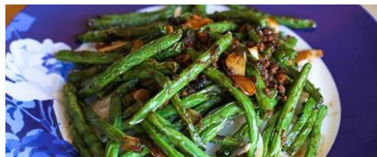
STRING BEAN Dry, sautéed string beans with minced pork 13.95