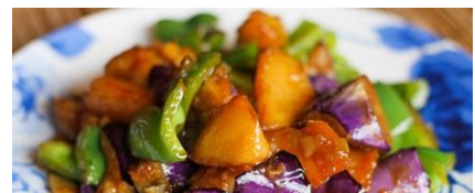
CHINESE STYLE EGGPLANT; POTATO & GREEN PEPPER 地三鲜 18.95