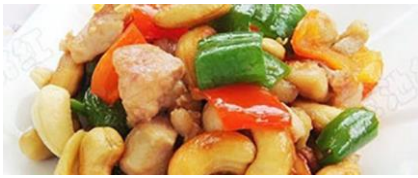
CASHEW CHICKEN Stir-fried w/cashews & celery 20.95 / 22.95