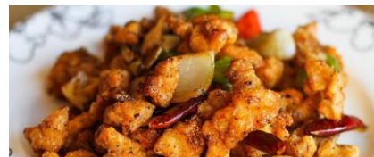
CRISPY CHICKEN Stir-fried w/hot & sweet sauce 19.95 / 21.95