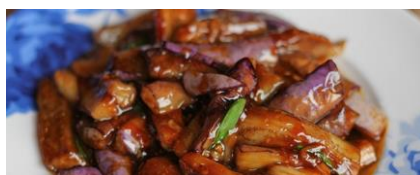
EGGPLANT W/ GARLIC SAUCE 13.95