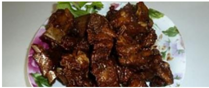
CRISPY PORK RIB W/CUMIN 孖然排骨 20.95