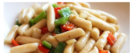
STICKY RICE NOODLES W/ VEGETABLES 15.95