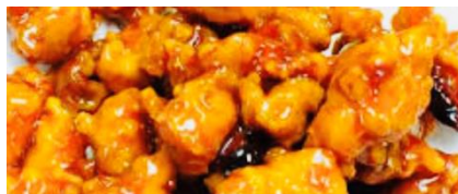
CRISPY ORANGE CHICKEN 19.95 / 21.95