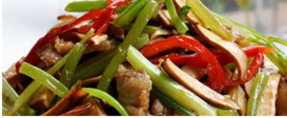
SHREDDED PORK W/BEAN CURD & CELERY 香干芹菜肉丝 19.95 / 21.95