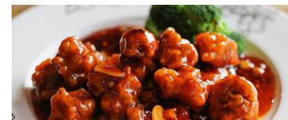
GENERAL TSO'S CHICKEN 18.95 / 19.95

* Consuming raw or undercooked meat, poultry; seafood or egg may increase your risk of food-borne illnesses.