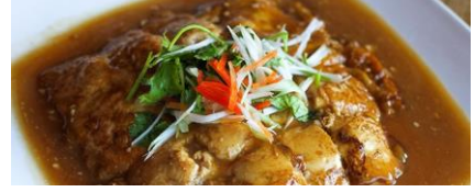
CRISPY TOFU W/ PORK 鍋縱豆腐 23.95