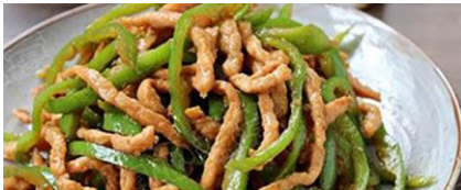
SHREDDED PORK W/ HOT PEPPER 尖椒肉丝 19.95 / 21.95