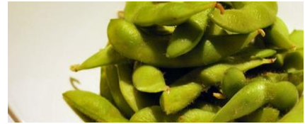
EDAMAME OR CHARCOAL BLACK BEAN EDAMAME 7.5 / 9