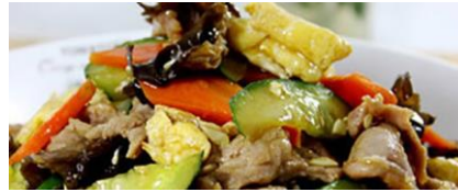
MU SHU PORK 木須肉 Shredded pork w/ mushrooms, scallions & egg 18.95 / 20.95