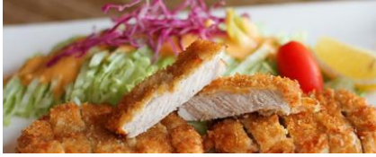
TON KATSU 日式豬扒 Japanese style pork cutlet 20.95