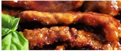
SWEET & SOUR PORK LOIN 醋醋哩嶼 Stir fried w/ pineapple, bell peppers, onions & ginger 20.95