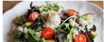
CRAB MEAT SALAD Sesame dressing 16.95