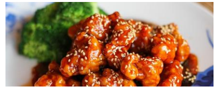
SESAME CHICKEN 18.95 / 20.95