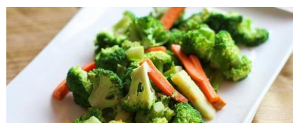
STEAM MIX VEGETABLE Broccoli, zucchini & carrots 15.95

* Consuming raw or undercooked meat, poultry; seafood or egg may increase your risk of food-borne illnesses.