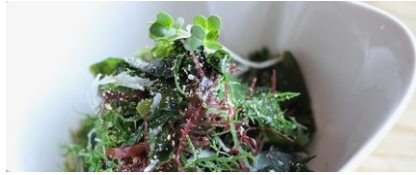
TAKUMI SEAWEED SALAD Mix of seaweed, radish sprouts & sesame seeds w/vinegar sauce 8.95