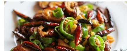
CRISPY PORK INTESTINE W/ HOT PEPPERS 辣子肥肠 20.95