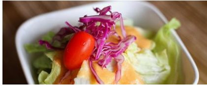
HOUSE SALAD W/ GINGER DRESSING 4.5