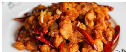
CHICKEN W/HOT PEPPER 重庆辣子雞 Mild spice 19.95 / 21.95