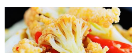
SPICY CAULIFLOWER 15.95