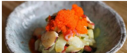
TAKO-SU Octopus, cucumber, seaweed & homemade ponzu sauce 8.5