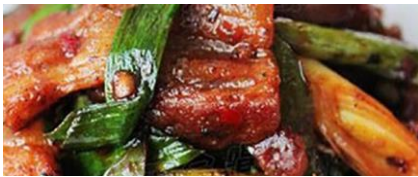
DOUBLE COOKED PORK BELLY 回锅肉 19.95 / 21.95