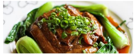
STEAMED PICKLES W/ PORK BELLY 腌菜扣肉 22.95