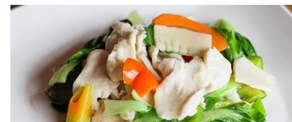
SLICED CHICKEN W/ CRISPY RICE 18.95 / 20.95