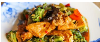
STIR-FRIED CRISPY TOFU W/ VEG 13.95