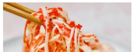
KANI SALAD 14.95