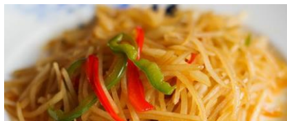
HOT & SOUR SHREDDED POTATO 12.95