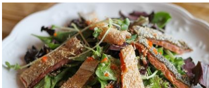
SALMON SKIN SALAD Toasted salmon skin w/Japanese sesame dressing over mixed greens 10.95