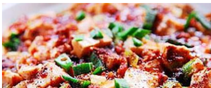
MAO POE TOFU w/red chili 13.95