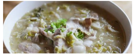
STIR-FRIED SHREDDED PORK W/ HOMEMADE PICKLES 酸菜½白肉 22.95