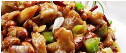
KUNG PAO CHICKEN Quick-fried w/peanuts, chili peppers & scallions 18.95 / 21.95