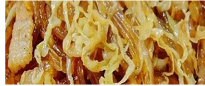
SHREDDED PORK W/ SOUR VEG. & RICE NOODLES 酸菜炒粉条 18.95 / 20.95