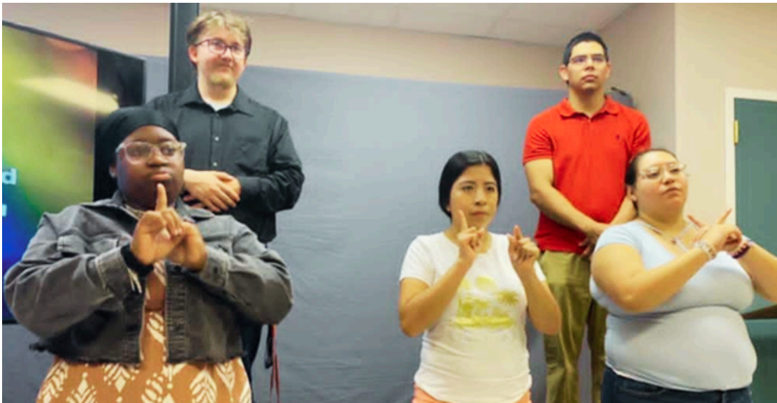
DHC Young Adults led Worship Service May 18th

Lord's Supper June 1 Beaumont ASL Social June 14 Father's Day June 15