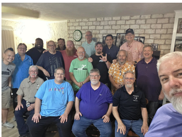
<~~~The Men The Pastors ~~~>

We are not meant to live the Christian life alone but as members of one body, supporting and uplifting each other. Through that unity, the church shines as a light of hope and love to everyone around it. Bless someone today!