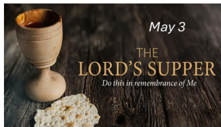
Lord's Supper Sunday May 3

If you missed a Newsletter you can see them at https://deafheartchurch.org/newsletters