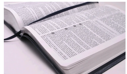
Warrirors for Christ Men's and Women's Bible Study Tuesday May 12