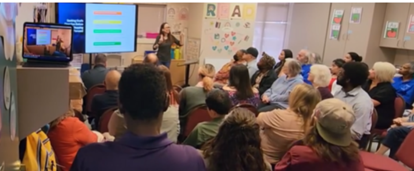
Faith Builders Digging Deep!