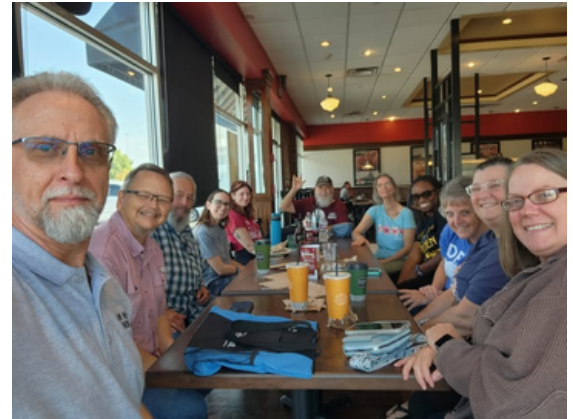
DHC Coffee Chat