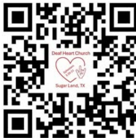
Deaf Heart Church QR Code

We are located in Sugar Land, Texas Southwest Houston Sugar Land Baptist Church 16755 SW Fwy, Sugar Land 77479 Door 9