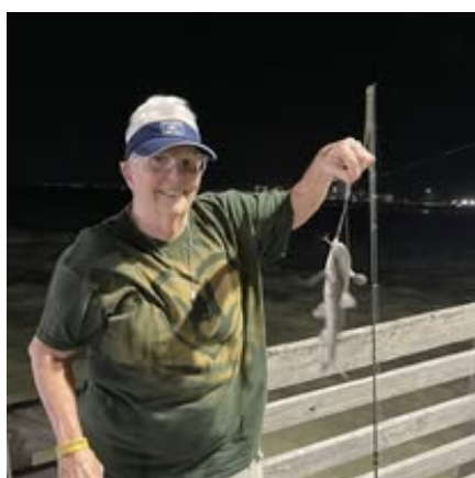
Fishing at Galveston Pier