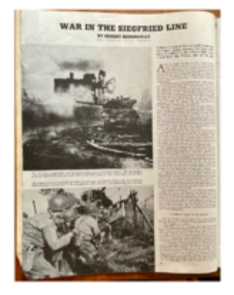
Collier's Magazine Photo from authors' collection

Hemingway's reporting aimed to do just that. The opening paragraph of Hemingway's article "War in the Siegfried Line" for the November 18, 1944 issue of Collier's magazine addresses which