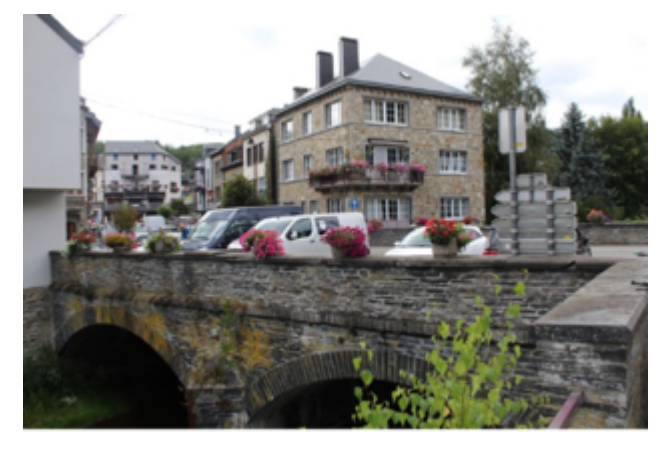
Houffalize Bridge today.

The Houffalize Bridge spans several World War II motifs, including destruction and rebuilding, a path forward for the Allied advance, solidarity between the American troops and the resourceful Belgian villagers, and a demonstration of only-in-wartime levity between a regimental commander and his famous writer friend. The stone bridge stands today as a flower-bedecked monument with plaques expressing Lanham's gratitude toward the town's skilled artisans who built a new bridge in 45 minutes.